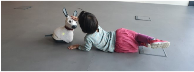
Figure 2: Participant Interacting with MiRo-E Robot

interactions. Moving, feeling, thinking, observing, speaking, and hearing are the six senses implemented in the robot.