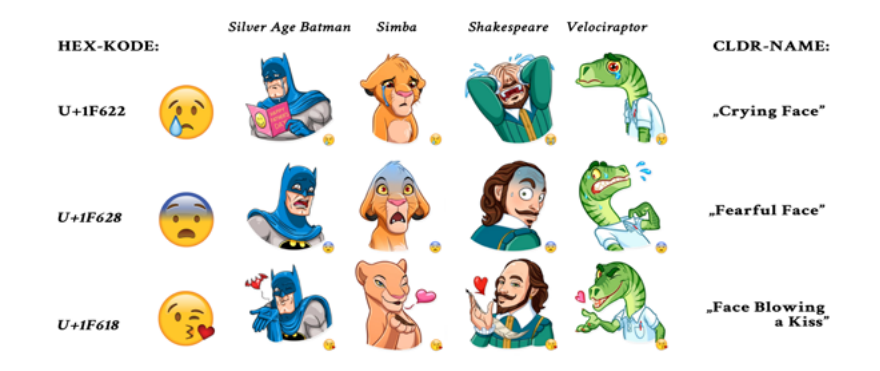
Figure 2: Telegram sticker sets for three existing core emoji

A further technical development is represented by digital stickers which are specific to individual messengers and platforms. Interestingly, the stickers in the Telegram messenger app (and many others like Signal) could be regarded as advanced translations of emoji or, in crude terms, as >second-order emoji< (cf. fig. 2). Instead of the existing glyphs, high-resolution (and increasingly animated) graphics, which can likewise be uploaded and downloaded in sets, can thus be inserted into messages.