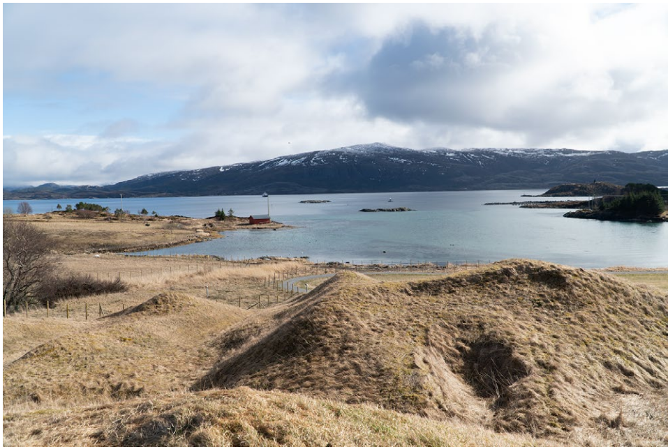
Figure 3. The Herlaugshaugen burial mound on the island of Leka. In the background the Lekafjorden and the island of Austra on the other bank of the fjord.

The largest and most dominant of the burial mounds is the aforementioned Herlaugshaugen in the area of the farm Skei, a monumental mound 62 m in diameter and seven m high (cf. Stamnes 2015, p. 17) (Fig. 3). Excavations in the 18 th century yielded features that were interpreted as a boat grave with a chamber and animal grave goods, thus probably dating the grave to the Late Iron Age (cf. Petersen 1917). However, the descriptions of these early excavations indicate that a stone cairn seems to form the core of the monumental mound. Geophysical investigations conducted in 2012 indicated that the mound was constructed in several phases. Whereas these investigations gave no clear indications of a ship burial, a construction in the centre of the mound was detected, which might be the supposed central cairn (Stamnes 2015, p. 76).