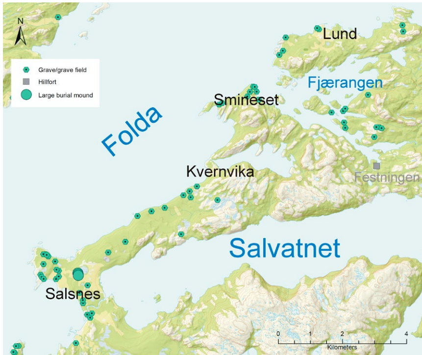
Figure 5. Map of the Folda-Salvatnet-area. Basic map by Kartverket – www.kartverket.no . Illustration: B. Maixner.

Finally, two place names at the Leknessjøen bay contain the Old Norse word naust , as a term for a massive boathouse, as opposed to a light shelter (Old Norse hróf ) (Falk 1912, p. 27-8). These are the field names Nausthaugen and Naustskjæret , both found in the area where Harald Egenæs Lund observed one of the boathouse sites mentioned in the 1950s.