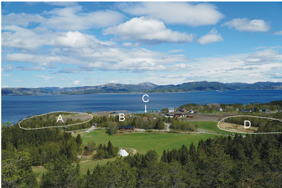
Figure 10. The area of the Lund farm, seen from the hill Nonhaugen. In the background the Folda firch. A Viskogan. B Farmyard of the present-day farm of Lund. C Rocky outcrop at the present-day farm of Lund. D The silted-up lake Stortjønna.