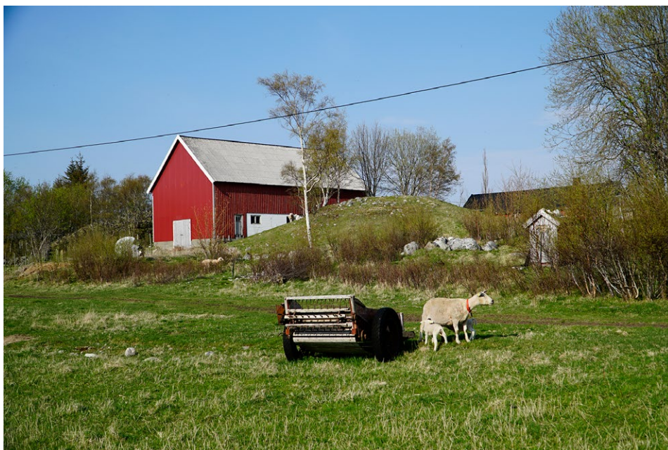
Figure 8. The northern and middle of the three large burial mounds at the present-day farm of Vestergården, Salsnes, seen from the west.

Apart from the constructions of the large burial mounds and the hillfort, the archaeological sources from the Folda-Salvatnet-area are sparse. Similar to the island of Leka, there is a large number of small burial mounds and cairns, which are mainly concentrated on the coast (Fig. 5). An exception are the three aforementioned large burial mounds lying in a row on a beach wall in the area of the farmyard of the modern farm of Vestgården (Fig. 6, 8). Today, the mounds are shut in between modern buildings and high vegetation in spots, but originally, they may have been visible from afar, and especially from the sea. The two outer mounds are cairns and are about 30 m in diameter, the middle one, which appears to consist mostly of earth, is slightly smaller. No dating information is available about them.