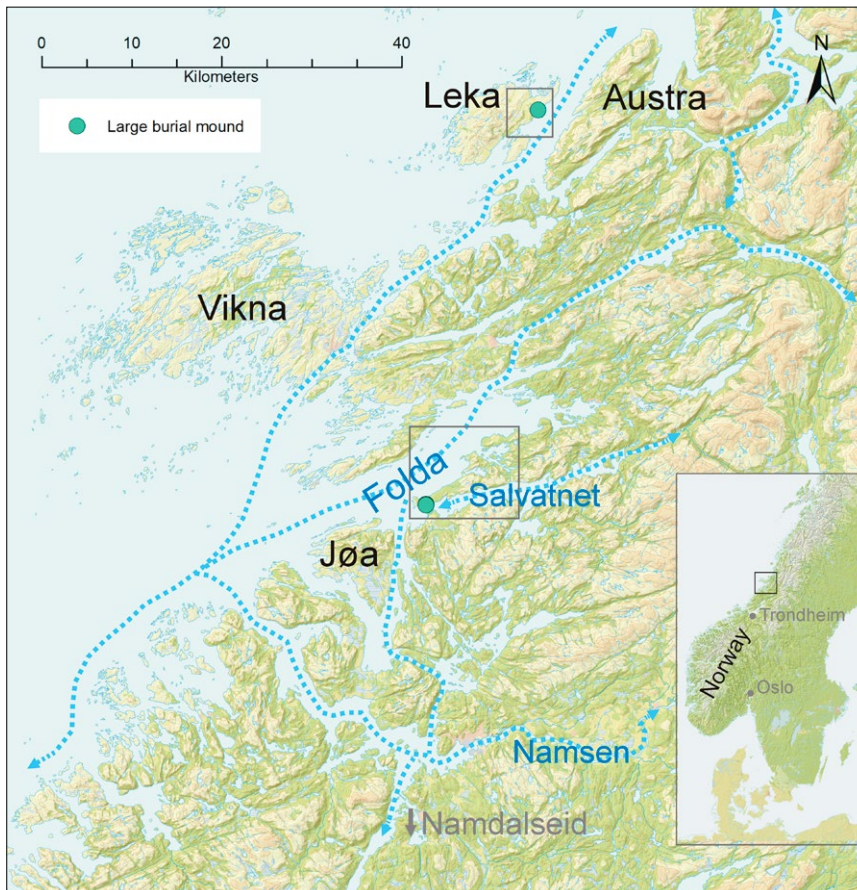
Figure 1. Distribution of large burial mounds with a diameter of over 20 m in the coastal landscape of northern Trøndelag. The areas under investigation in the article are marked with red rectangles. Basic map by Kartverket – www.kartverket.no . Illustration: B. Maixner.

The archaeological data used in this study are derived from two databases: the Norwegian University Museums' collection databases (Universitetsmuseenes samlingsdatabaser) and the Directorate for Cultural Heritage's database of monuments and sites (Askeladden) in Norway. The following abbreviations will be used for the museum inventory numbers: B: University Museum of Bergen; T: NTNU University Museum. The place names are collected from The Norwegian Mapping Authority's official database of place names, Sentralt stadnamnregister (SSR) ( kartverket.no ).