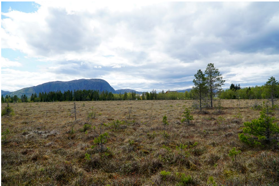
Figure 9. The Stormyra bog at the present-day farm of Vestergården, Salsnes, seen from its north-eastern edge.

In contrast, there are no known finds from the area of Smineset and Lund that can be dated with certainty to the Iron Age. However, there are two indications of iron extraction and processing from the vicinity of the farm of Smineset, namely an iron extraction site in a bog rich in bog ore (Askeladden ID 26298), and two slag deposits near the present-day farmyard (Askeladden ID 55997 and 16634). The dating of these sites is unknown, but generally the extraction of local bog-ore deposits near the settlements is a phenomenon that is older than the extensive specialised exploitation of rich bog-ore deposits in the mountain regions from the ninth century on (cf. Barndon and Olsen 2018, p. 80).