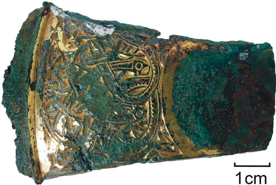
Figure 4. Fragment of disc-on-bow-brooch (T18340) from Leknes on the island of Leka.