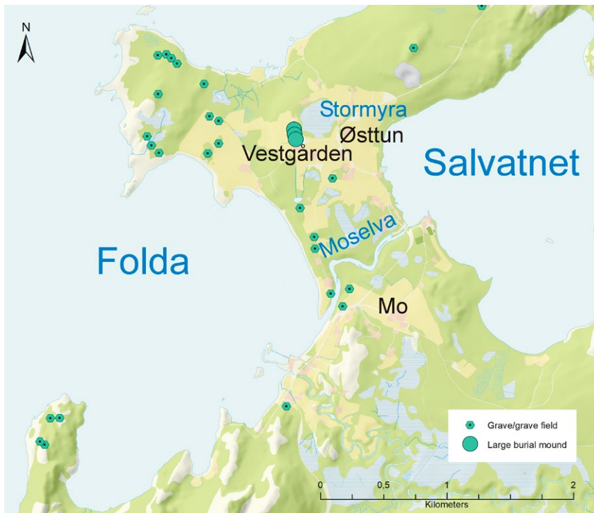
Figure 6. Map of the Salsnes-area. Basic map by Kartverket – www.kartverket.no . Illustration: B. Maixner.

The second area on the coast of North Trøndelag where the presence of large burial mounds suggests a central site complex is the headland between the firth Folda and the large lake Salvatnet (Fig. 5).