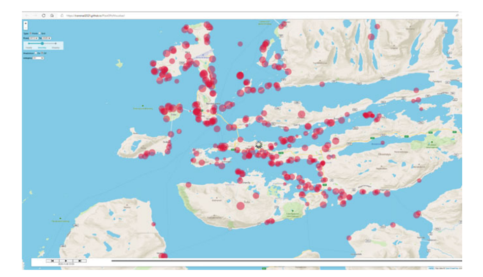
Fig. 8.1 Interactive visualisation platform displaying the marine litter collected by volunteers in Møre and Romsdal cumulatively between 2013 and 2021 as recorded on Rydde, developed as part of the PlastOPol project

The second tool consists in a model that detects litter objects in photos, which is itself embedded in an app that can also work offline. This constitutes a feat of technology as it requires compressing very large infrastructures into portable devices