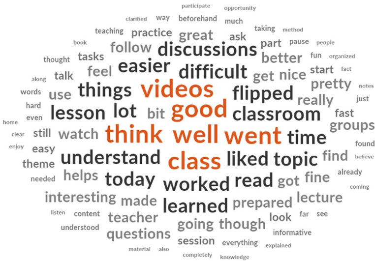
Fig. 4 Immediate feedback on FC from student teachers

Furthermore, 79.41% of participants agreed or strongly agreed that with the learning experience of FC, they could do better in another FC course. However, compared with the willingness and fondness of taking another FC course by themselves, less than half of the participating STs (41.18%) agreed or strongly agreed that they would like to adopt FC in their teaching.