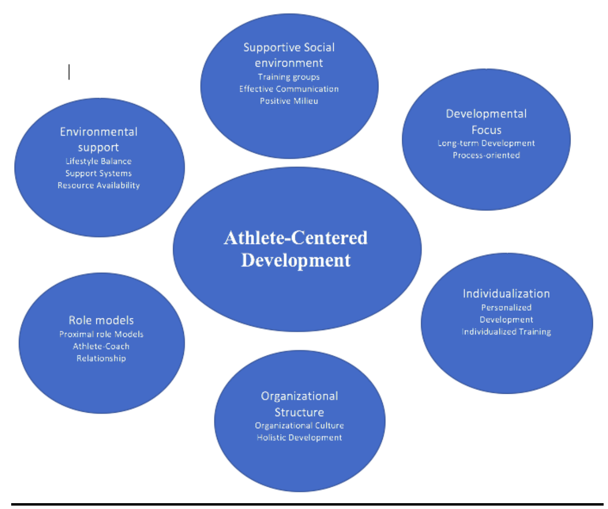
Model 1: Athlete-Centered Development