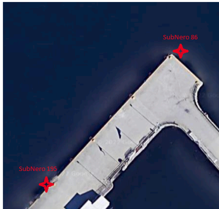
Fig. 4. Field experiment setup.