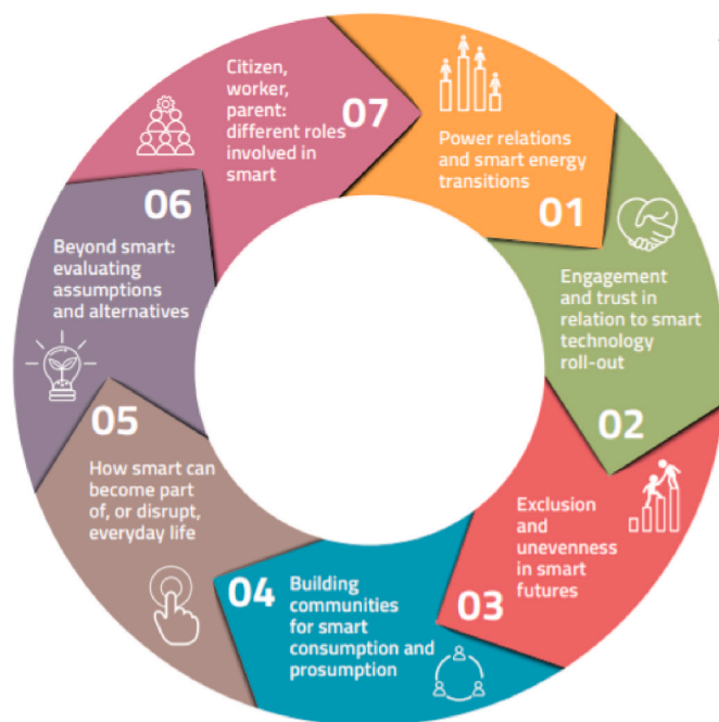
Fig. 2. The seven Themes of the Energy-SHIFTS Smart Consumption research agenda.

which social and technical elements are interrelated and cannot be understood as separate entities (Köhler et al., 2019; Geels, 2018).