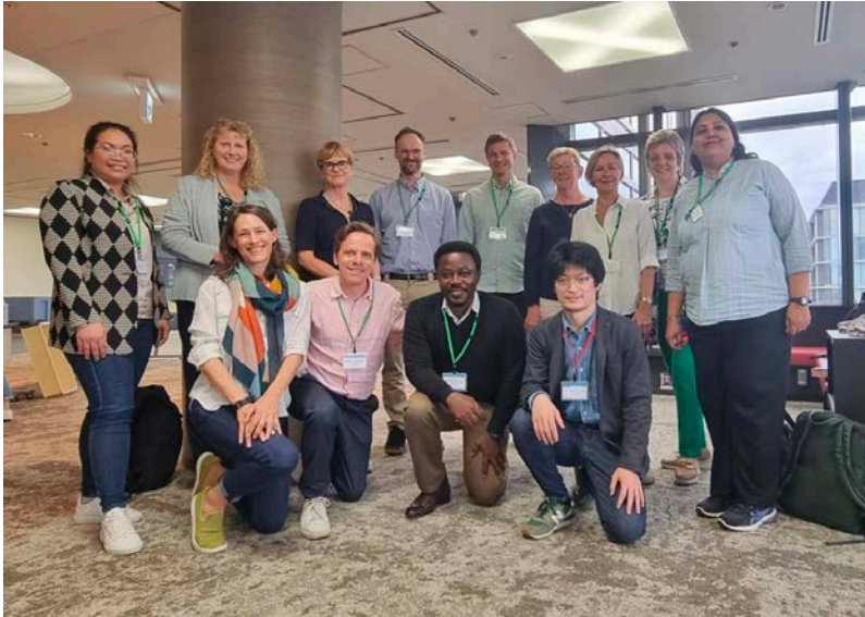
Figure 9 TWG7's participants in Japan - EDUsummit2023

thinking at each phase of the work. This data indicated the depth and breadth of the challenge we were undertaking. One of the final tasks for TWG7 was for each individual to bring one case study related to learning spaces to the EDUsummit meeting in Japan. Figure 2 presents TWG7's face-to-face participants in Japan.