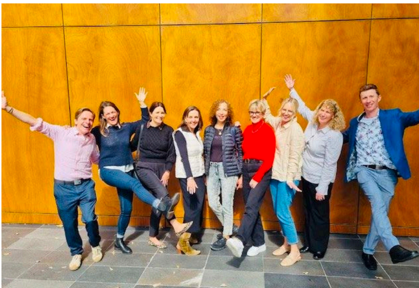
Figure 8 TWG7's participants in the hybrid meeting in Wollongong

TWG7 has worked face-to-face, online, hybrid/synchronous or asynchronous, based on the principles of our TWG, integrating digital and physical learning environments. We began prior to the hybrid meeting in Wollongong and continue to do so. Figure 8 presents those TWG7 members who were able to make it in person to the hybrid meeting in Wollongong.