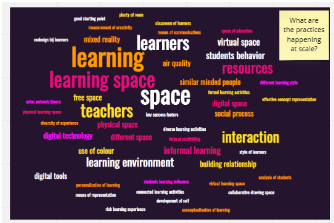
Figure 7 TWG7 20220825, Online Whiteboard for Visual Collaboration (miro.com)

TWG7 has worked face-to-face, online, hybrid/synchronous or asynchronous, based on the principles of our TWG, integrating digital and physical learning environments. We began prior to the hybrid meeting in Wollongong and continue to do so. Figure 8 presents those TWG7 members who were able to make it in person to the hybrid meeting in Wollongong.