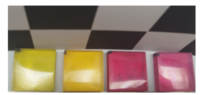
Figure 5. Yellow and magenta 3D printed samples with different translucency.

Kiyokawa et al. investigated how the perception of translucency is affected by the glossiness of a surface. The authors hypothesize that the perception of translucency is influenced by surface gloss, which affects the amount and distribution of light reflected from the surface. To test this hypothesis, the authors conducted two psychophysical experiments using computer-generated stimuli of spheres with varying levels of translucency and glossiness. Participants were asked to rate the degree of translucency of each image. The results of the experiments show that the perception of translucency is significantly influenced by the glossiness of the surface. Specifically, the perceived translucency increases as the glossiness of the surface increases, even when the actual level of translucency is held constant [94]. They propose a computational model based on measurable image features informative of shading relative to specular highlights. Furthermore, the discrepancy in orientation anisotropy between specular highlights and shading gradients is a beneficial cue in translucency perception, and in the perception of translucency in glossy objects, our visual system utilizes the low-level image features corresponding to the 3D shape, such as the anisotropy of luminance orientation.