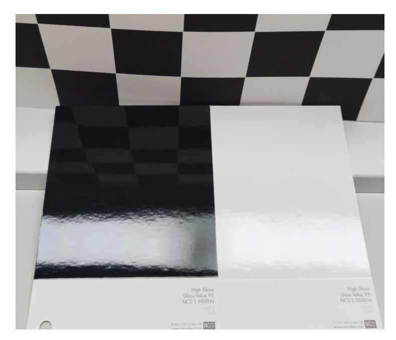
Figure 4. Samples with the same specular gloss but different color.

Color and gloss are two key attributes that contribute to the visual appearance of surfaces. They are distinct properties, but they are often closely related, as changes in one can affect the perception of the other. The interaction between light and surface can cause changes in both gloss and color, depending on a range of factors, such as the composition and structure of the material, the angle of incidence and reflection of the light, and the viewing conditions. For example, a smooth and uniform surface with a high gloss value will reflect light more uniformly and create a clearer, more vibrant color appearance. In contrast, a rough or irregular surface with a low gloss value may scatter and diffuse light more, creating a duller, less saturated color appearance. The relationship between color and gloss is complex and multifaceted and can be influenced by a range of factors. An example of two samples with the same specular gloss and different color is shown in Figure 4. By understanding and controlling both attributes, manufacturers and designers can create surfaces that meet the desired aesthetic and functional requirements for a range of applications.