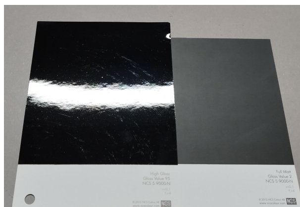
Figure 1. Samples with the same color and different specular gloss (95 GU on the left and 6 GU on the right) measured at a 60° incidence angle.

The concept of gloss has long captivated researchers and professionals in various fields, including material science, surface engineering, graphic design, etc. Over the years, various methods have been developed to measure and quantify gloss, providing valuable insights into the physical and perceptual aspects of gloss. In this chapter, we explore the different approaches to gloss measurement, divided into two categories: physical gloss measurements and perceptual gloss measurements. By examining these two perspectives, we can gain a comprehensive understanding of gloss and its multifaceted nature. In Figure 1 two samples with the same color and different glossiness are shown.