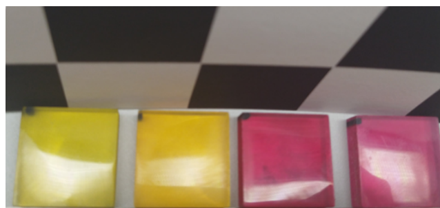
Figure 5. Yellow and magenta 3D printed samples with different translucency.

Kiyokawa et al. investigated how the perception of translucency is affected by the glossiness of a surface. The authors hypothesize that the perception of translucency is influenced by surface gloss, which affects the amount and distribution of light reflected from the surface. To test this hypothesis, the authors conducted two psychophysical experiments using computer-generated stimuli of spheres with varying levels of translucency and glossiness. Participants were asked to rate the degree of translucency of each image. The results of the experiments show that the perception of translucency is significantly influenced by the glossiness of the surface. Specifically, the perceived translucency increases as the glossiness of the surface increases, even when the actual level of translucency is held constant [94]. They propose a computational model based on measurable image features informative of shading relative to specular highlights. Furthermore, the discrepancy in orientation anisotropy between specular highlights and shading gradients is a beneficial cue in translucency perception, and in the perception of translucency in glossy objects, our visual system utilizes the low-level image features corresponding to the 3D shape, such as the anisotropy of luminance orientation.