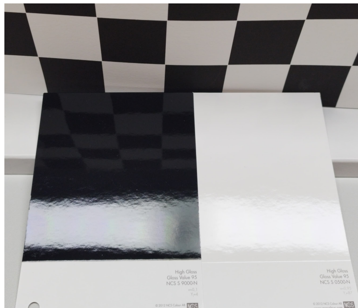
Figure 4. Samples with the same specular gloss but different color.

Color and gloss are two key attributes that contribute to the visual appearance of surfaces. They are distinct properties, but they are often closely related, as changes in one can affect the perception of the other. The interaction between light and surface can cause changes in both gloss and color, depending on a range of factors, such as the composition and structure of the material, the angle of incidence and reflection of the light, and the viewing conditions. For example, a smooth and uniform surface with a high gloss value will reflect light more uniformly and create a clearer, more vibrant color appearance. In contrast, a rough or irregular surface with a low gloss value may scatter and diffuse light more, creating a duller, less saturated color appearance. The relationship between color and gloss is complex and multifaceted and can be influenced by a range of factors. An example of two samples with the same specular gloss and different color is shown in Figure 4. By understanding and controlling both attributes, manufacturers and designers can create surfaces that meet the desired aesthetic and functional requirements for a range of applications.