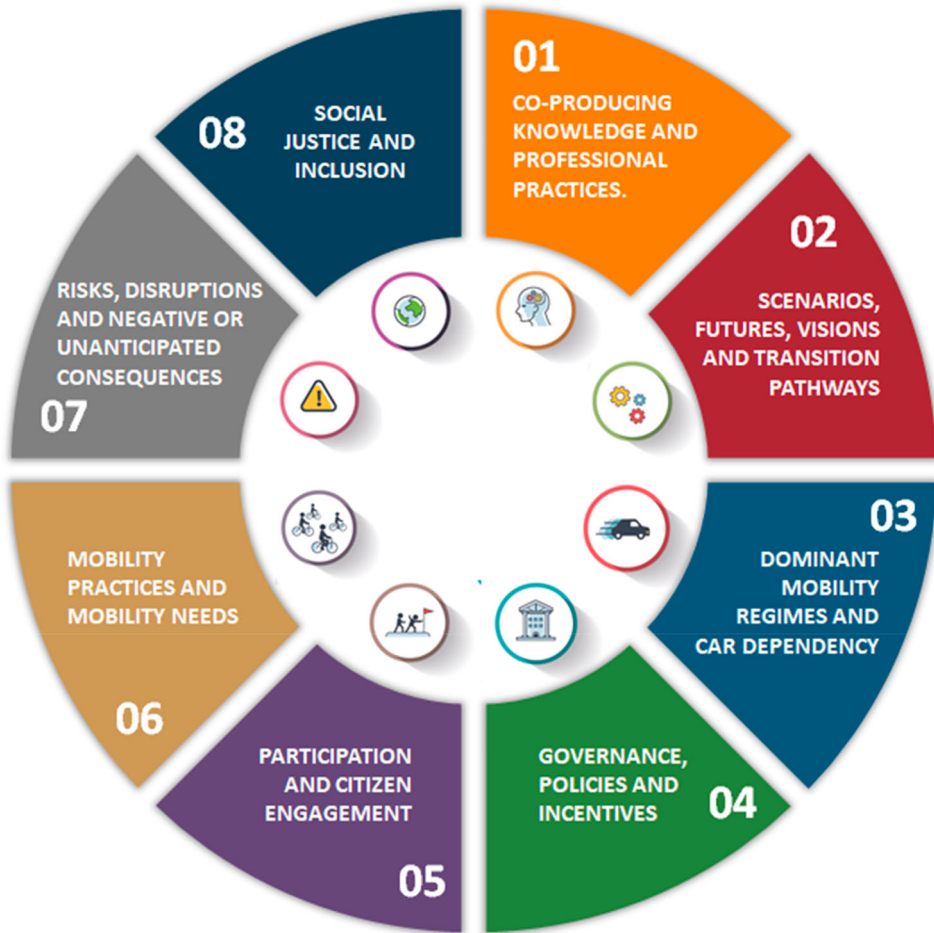
Figure 1. Eight key themes generated by the Horizon Scanning (listed in random order).

develop in order to: facilitate processes of learning across different professions, domains and sectors; foster more transdisciplinary research, with systems thinking at its heart; and maximise the impact of SSH research on sustainable transitions?”. Questions such as this highlight the importance of input from different fields and ways to improve knowledge-producing and interdisciplinary processes such as co-producing knowledge with citizens, putting inclusion, justice, geographical and cultural differences at the centre of future research inquiry.