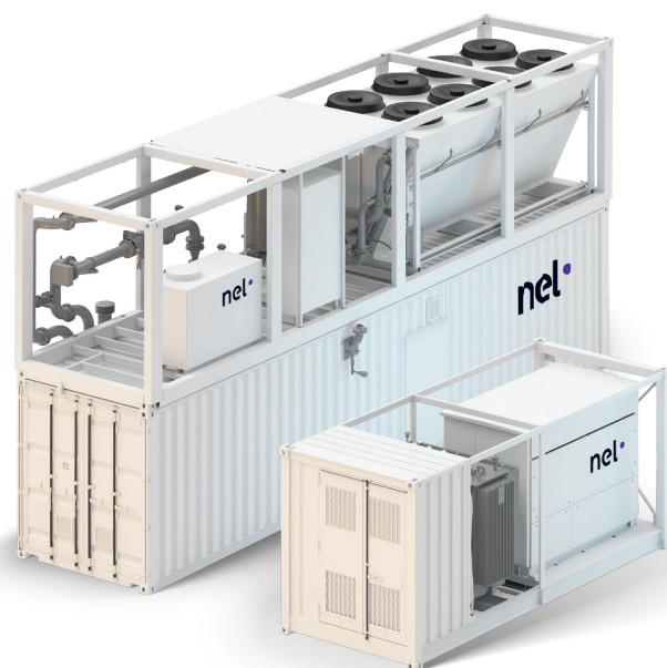
MC250 Power Supply Enclosure, Electrolyser Enclosure and optional Thermal Control System – installation may vary.