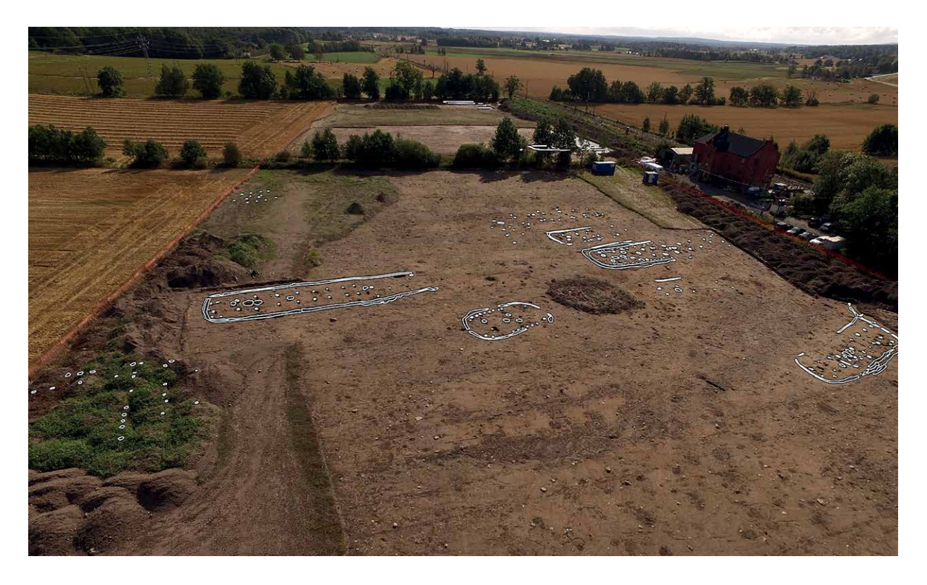
Figure 1. Settlement traces and their spatial distribution at Dilling, Moss, Southeast Norway. Illustration: Jan Kristian Hellan; Museum of Cultural History, University of Oslo.

At the outset, we highlight four aspects which characterize settlement archaeological research in Scandinavia today. First, differences in research traditions have contributed to notions of differing developments in settlement organizations within the Scandinavian countries. Second, differences in terminology between languages regarding settlement organization, particularly the words in Scandinavian languages for single farms and villages, contribute to different interpretations between national research traditions. Third, settlement organization differs between regions and periods rather than between the later national borders. Lastly, methodological developments contribute to increasingly rapid developments in results and interpretations, and open for a broadening range of opportunities in the years to come. The discussion of these four aspects, which forms the first part of this introduction, prepares the ground for our presentations of the contributions to the volume.