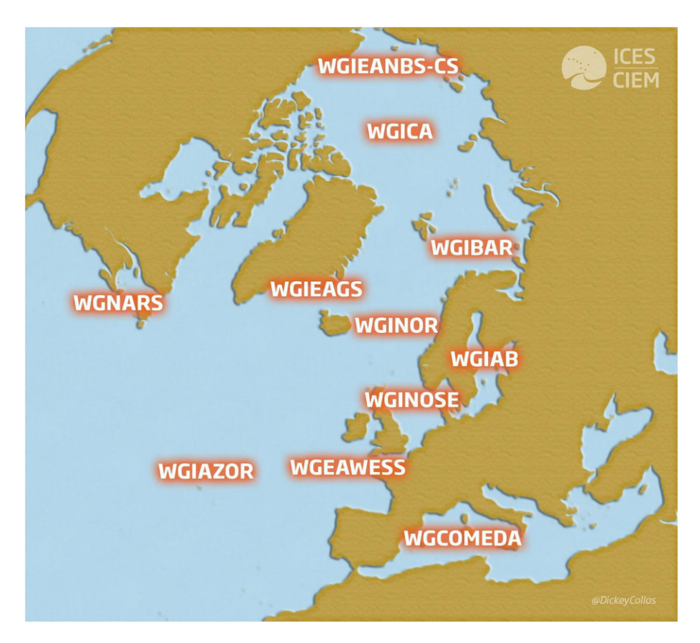
Figure 2. ICES IEA Groups and their Regional Seas Areas (see bracketed text below Fig. 1 for full names). N. B. WGNARS' Regional Sea extends to the east coast of North America.

They include a broad assessment of dynamics and relationships, rather than just status and trends of individual components. (iii) They include social, economic, and ecological elements. (iv) They consider humans as both impacting and being impacted. (v) They are iterative and adaptive for management. (vi) IEAs involve stakeholder input. These characteristics and their use in this paper are discussed further below, under (c) Analysis.