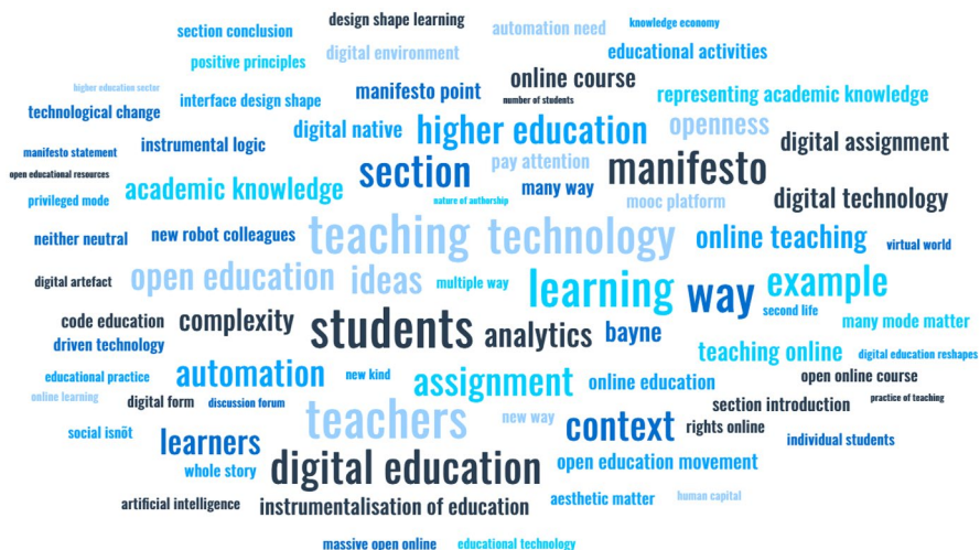
Fig. 3 Most frequent phrases in The Manifesto produced with MonkeyLearn ( https://monkeylearn.com/word-cloud/ ). Accessed 15 July 2021.)

My first concern is about what we teach when we teach online. Discussions about digital education often focus on ‘how’, ‘why’, and ‘whom’ we teach but rarely say much about ‘what’ we teach. And, when they discuss ‘what’, the most common answer is ‘academic knowledge’. The most frequent phrases in The Manifesto illustrate this (Fig. 3). One may argue that this is the way it should be. (In the end, universities are custodians of academic knowledge.) However, the pressing challenges of the present day—be it climate change, workplace diversity or truth decay—urge us to prepare students for working with knowledge across and beyond academic disciplines.