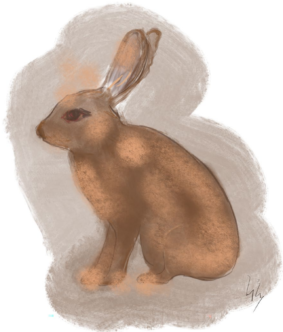
Fig. 1 The Manifesto and multimodality