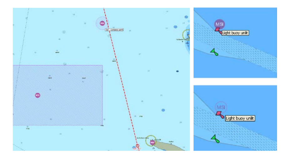
Figure 2. Example of portrayal of MSI integrated in the ECDIS display. Left, two Area MSIs and a point MSI, right, an unacknowledged MSI (top) and an acknowledged MSI (bottom).

The general approach was twofold: first, to automatically integrate the MSI and MN information into the ENCs and, secondly, to allow the mariner to filter out the information valid for their location, type of ship and task at hand. By displaying georeferenced information at the actual location a natural filter was invoked. The unlit beacon hundred miles away would no longer distract the watch keeper as it would not be seen (unless it was on the planned track of the vessel, in which case it would be shown). A cargo ship in transit should not be informed of new fishing restrictions in the area, and drifting timber in an area just passed should not give an alert. However an ice warning in the area ahead of the vessel would give an alarm and would need to be acknowledged. The aim was to do this in a user friendly way, not adding to the workload (but instead reduce it) and not cluttering the ECDIS screen. See figure 2. Much of this work was done already in the EfficienSea project.