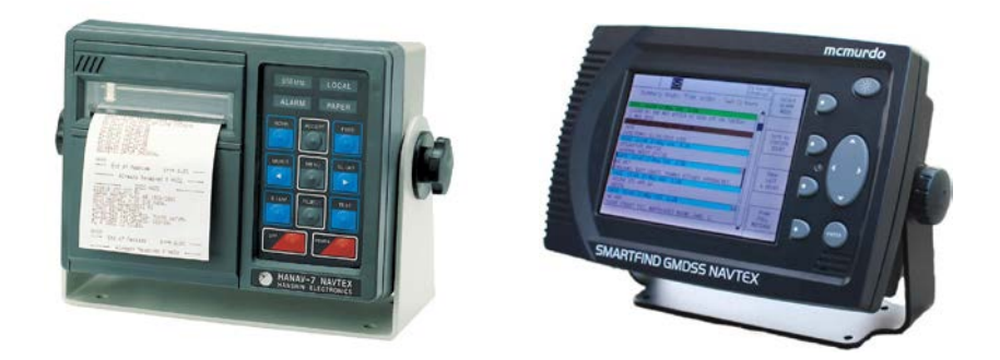
Figure 1. Two modern Narrow Band Direct Printing Telegraphy receivers, commonly called NAVTEX. Navigational warnings are received as text messages either on a paper print, or on the display.

The print out from these receivers still has to be "manually" integrated: read from the list, a decision has to be made weather that information is of any concern to me (it might be an unlit light many hundred miles away). If it is of interest you might need to go to the ECDIS and manually type in the coordinates to see what area the information is valid for.