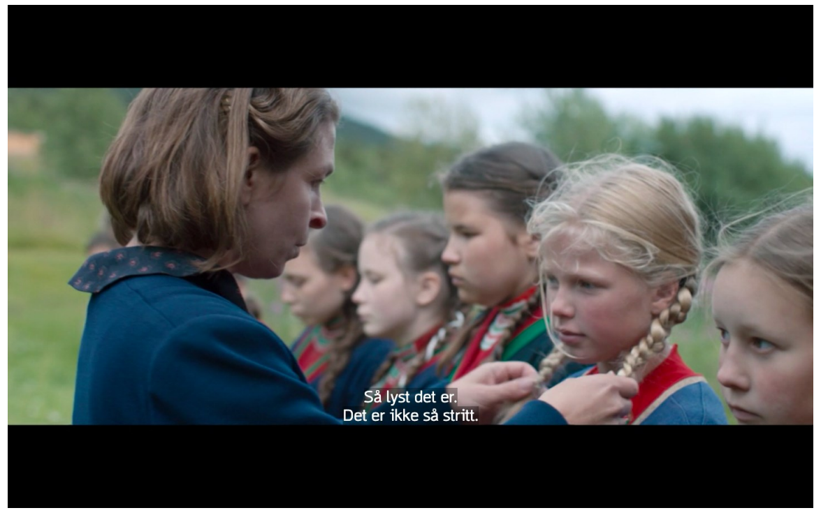
Figure 17: A white woman inspects and comments on the, in her pseudo-science, unexpected whiteness of Sámi children.

The researchers' methods also paved the way for and justified the racist violence at the hands of the village boys, who witnessed the systemic racism and learned from the state representatives, Sand argues (2022, 11). These key sequences violently express the imbalanced power relations and the objectification, as naturalized, dehumanized, racialized, sexualized, and/or commodified, through the ethnographic, colonial, and male gaze. The writer-director Amanda Kernell does not, however, uncritically reproduce familiar tropes. Instead, she exposes them and explores how the racist, colonialist, and sexist discourses in which they engage affect her characters. Thus, the sequences offer critical revisions and reversals of colonialist cinematic tropes as well as white settler policies towards the Sámi in the 1930s, some of which live on today. The scenes talk back to the discourse of dehumanization of indigenous women, as do all the films: Each in their own way, Rosie, Elsa, Anori, and Elle-Marja show resilience and refuse to be/stay reduced to animals, commodities, research objects, or sex objects. Elle-Marja manages to get the education she dreams of after she flees the violent racism and sexism that perpetuated life in nomad school. Elsa rejects the pocket money, and status as commodity or prostitute, then raises her boy on her own. Whether staying or leaving, all four demonstrate resourcefulness, pride, strength, and agency.