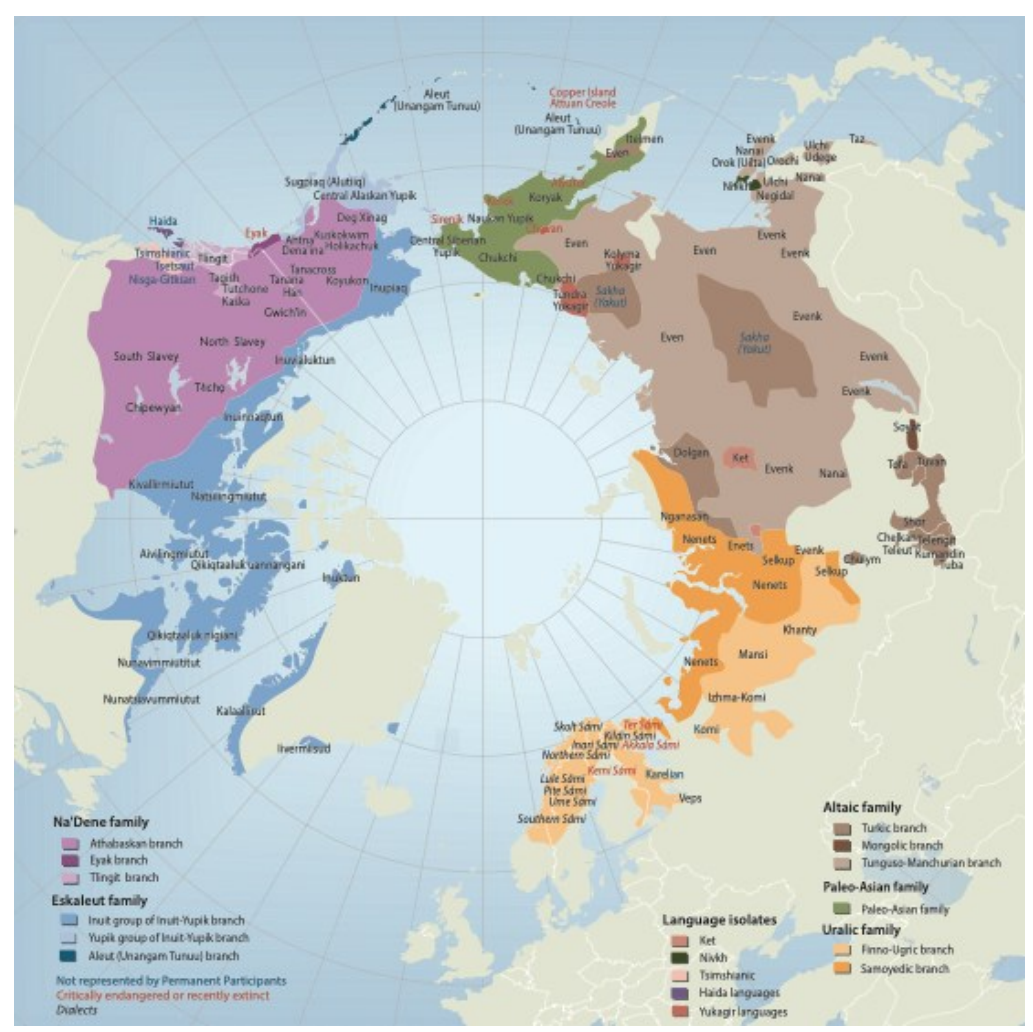
Figure 1: Map of indigenous peoples of the Arctic by language families (Arctic Council and UiT 2019)

The Indigenous Arctic is made up of territories that have been, and mostly still are, colonized either by their inclusion in the colonizing states<sup>5</sup> or through structures that remain in place despite decolonizing efforts (Knobblock and Kuokkanen 2015; Kuokkanen 2015, 2006a; Olsen 2016a). Indigenous Arctic refers in this context to areas and peoples where the common denominators are that they are indigenous<sup>6</sup> situated within the Arctic region. Estimations are that 10 percent of the population in the Arctic are indigenous, from more than forty distinct groups (Figure 1)<sup>7</sup>. Alaskan Natives, Sámi, Inuit, and Samoyedic peoples (Russia) are the largest populations – each comprising more specifically named peoples. The Arctic is however not a neutral term nor one that its inhabitants use commonly. Sámi, for instance, refers to their land as Sápmi, a territory that includes parts of Norway, Sweden, Finland, and Russia. Sápmi, according to pioneer Sámi scholar Alf Isak Keskitalo, is "the general concrete and abstract concept referring to our people, land, and spirit - in our own language" (1976). "Inuit" often refers to