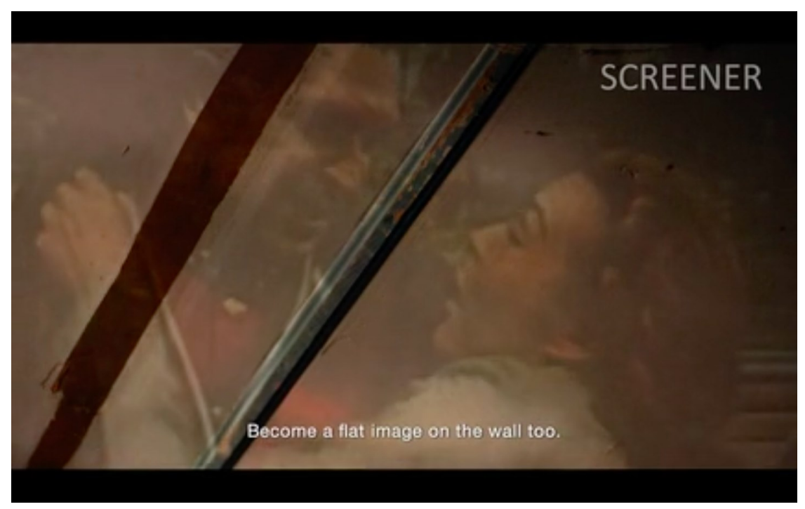
Figure 7: A Hollywood classic projected as a fantasy of Elsa onto her own retina or the ceiling of the family home. Her mother comments on the peril of Elsa becoming «a flat image».

Elsa's relationship with cinema changes after one dramatic, life-changing theater visit. On the screen, a white couple is quarreling, the man violently grabbing the woman by the arm and threatening her with a knife. The Inuit in the audience react with jawdropping astonishment and shout at the actors. One might read this as the Flahertian gramophone scene all over again. Instead, inspired by Raheja's alternative interpretation of Nanook's smile as an act of visual sovereignty (2007), I suggest that the audience's behavior is an adequate response to the action on screen, not the screen technology. Meanwhile, the American soldier with whom Elsa has exchanged looks in passing now signals to meet her outside. Elsa giggles at her girlfriends and steps out. Then the atmosphere quickly shifts, and the man forces himself onto her. (See next chapter for a discussion of this scene.) We never see Elsa go watch a movie again. The scene thus presents cinema as something alien to the Inuit community, which solicits fascination but also danger and division within the community. Yet the scene also demonstrates indigenous peoples' appropriation of technology. It reclaims cinema as a medium that can exercise survivance (Vizenor 2008), in showing a community that resists the colonial worldview while appreciating cinematic storytelling.