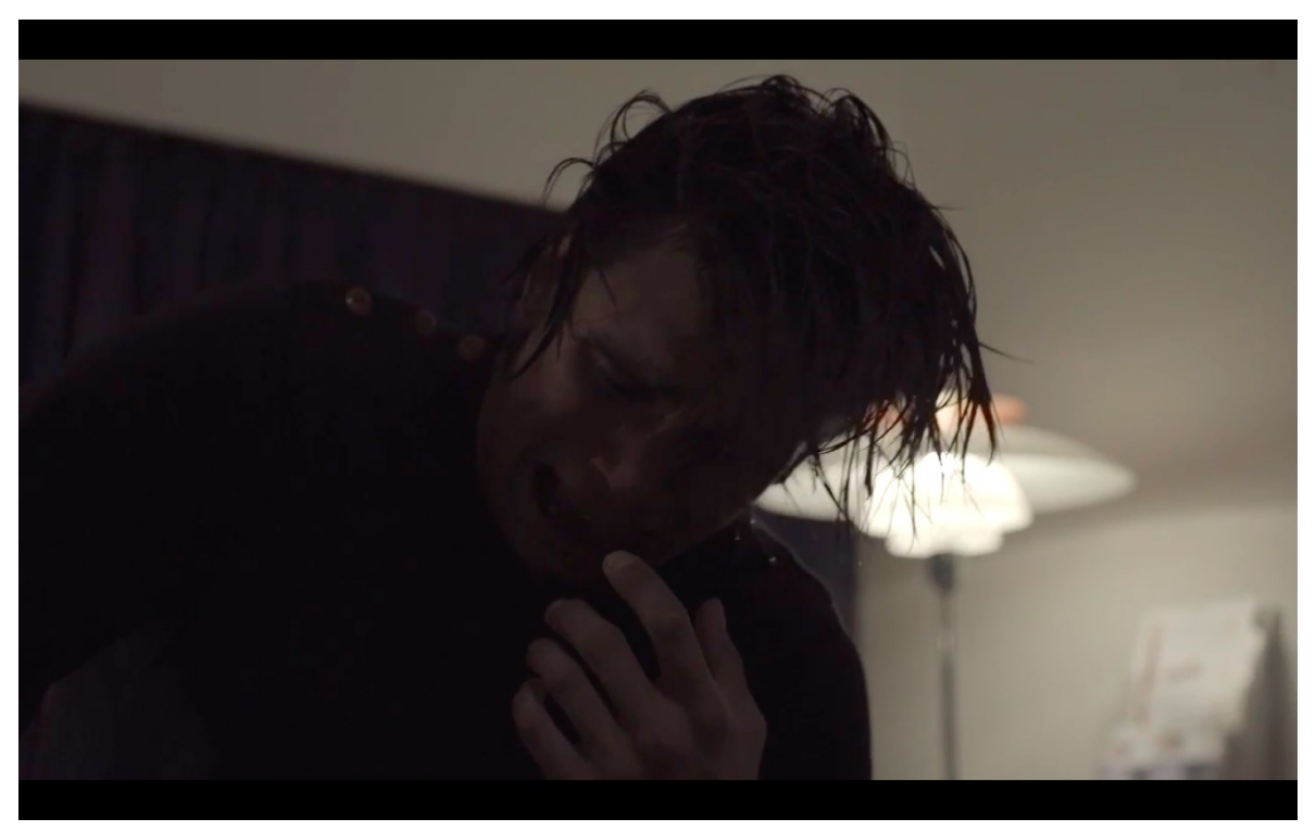
Figure 18: Malik demonstrating internal conflict related to the sexualized assault he commits against Anori in the hotel.

A joint result of the external and internal explications is that while male leaders' (and laymen's) responses are reluctant, refuse, or fail to recognize and respond to the problem, women are being curfewed and muzzled. Overall, an immense silence encloses