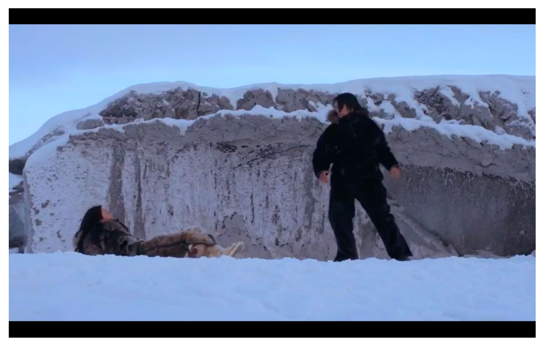
Figure 9: The girl/woman in the myth fights «evil», but is overpowered in the end, sacrificing herself for the «good».