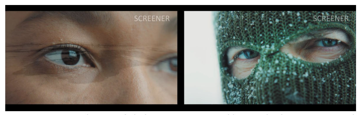
Figure 10: Extreme close-up of Elsa's eyes superimposed by Inuit landscape, juxtaposed with anonymous American soldier looking straight into Elsa's observing eye as the camera lens later in the film.

to it the ethnographic and the colonial gaze. The soldier and indirectly the settler state he represents thus objectifies Elsa as woman, indigenous, and subject to conquer. (Not all male settlers in this film are portrayed in the same way: The policeman and the priest, more invested in the community, exercise the colonial gaze but not particularly the male gaze.) The eye of the camera in Restless River engages the male, ethnographic, and colonial gazes in a way that exposes them for what they are. The Inuit audience at the cinema refuses to «participate in the pleasures offered by dominant cinema» (Columpar 2002, 29). The scene demonstrates the explanatory force of the male, ethnographic and colonial gaze. However, it also dismantles, at least in this instance, the original theory of the power that the male gaze exerts on camera, characters, and audience of fiction films, and destabilizes Mulvey's postulate that the male gaze structures the audience to assume a masculinized look.