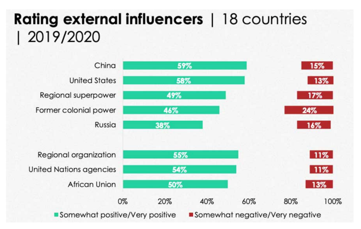
Figure 2 Rating external influencers (Olander, 2020)

The graph above shows an overview of how African countries rate external influencers. Continent wide, it seems to be the trend that China is the most popular amongst the external influencers.