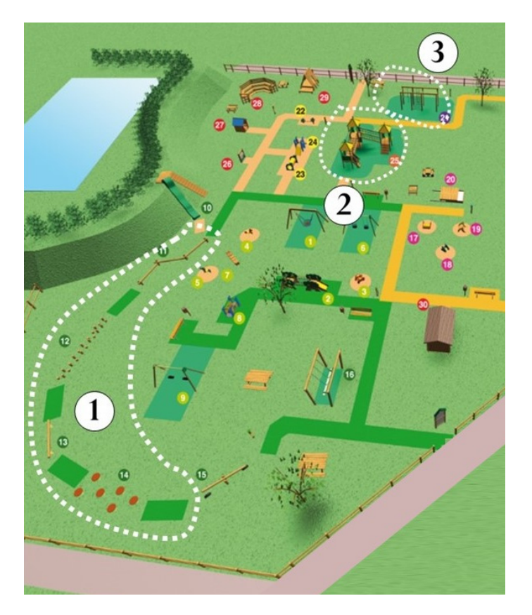
Figure 2. Dotted lines limit the areas where structured activities were run. 1: Balance area; 2: mobility area; 3: manual dexterity area. Active play (unstructured activities) could be performed everywhere else in the park according to children's choice.