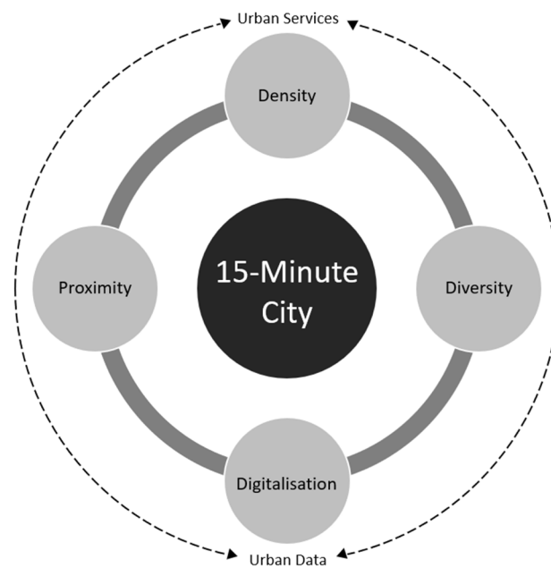
Figure 1. The 15-minute city framework as introduced by Moreno, Allam, Chabaud, Gall, and Pratlong [11].