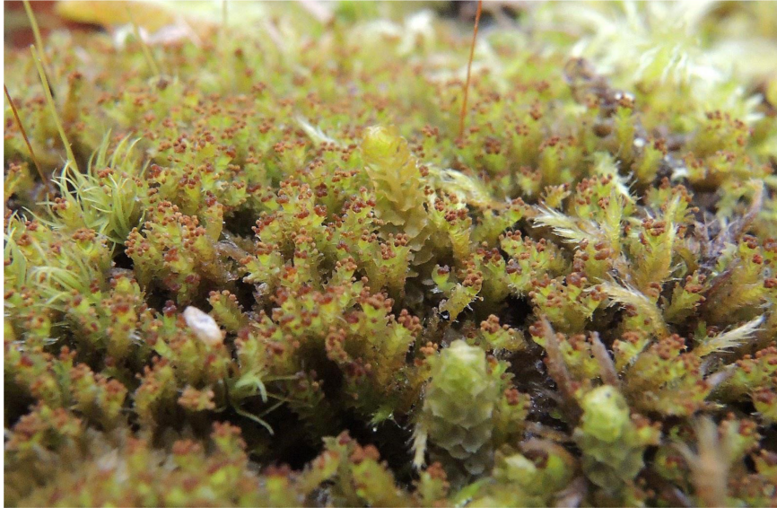
Figure 1. Lophozia lantratovae growing on a boulder in mixed mountain birch forest.

birches in moist to wet areas, often together with species like Lophozia silvicola H.Buch, Ptilidium pulcherrimum (Weber) Vain. and Dicranum montanum Hedw. We have seen material from 310 to 730 m a.s.l.