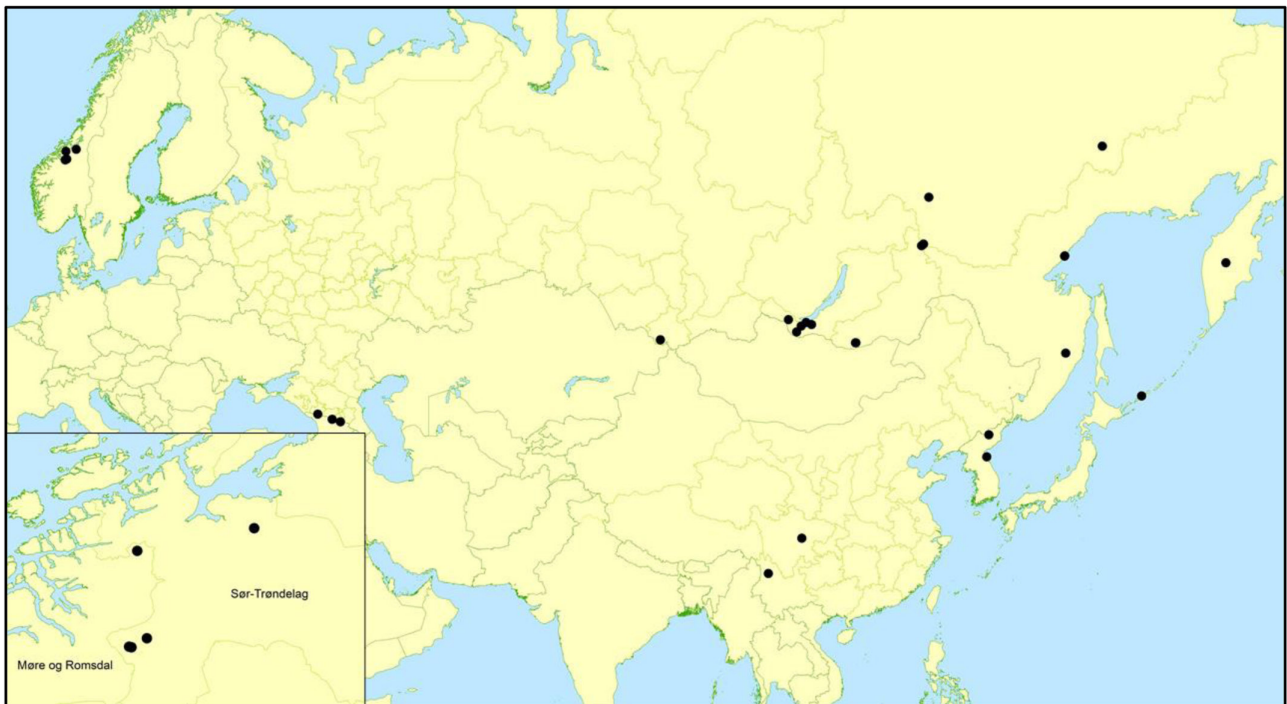
Figure 4. Confirmed distribution of Lophozia lantratovae globally and in central Norway (inset map).

ing, dead Betula pubescens , 35 cm dbh in Picea abies -dominated Vaccinium myrtillus forest., 2021.08.21 T. Prestø, det. T. Prestø (TRH B-116253).