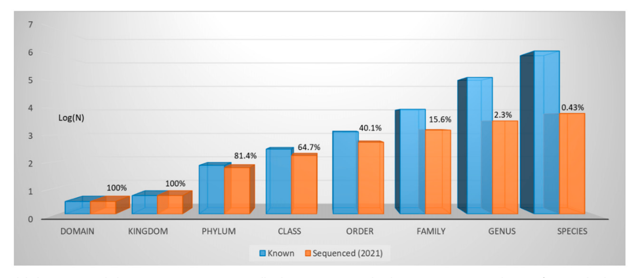
Fig. 1. Global progress in whole-genome sequencing across all eukaryotic taxonomic levels. Data source: National Center for Biotechnology Information, March 4, 2021 (18).

The EBP-affiliated projects have sequenced the genomes of 1,719 eukaryotic species, all of which have assemblies deposited in public domain databases (Table 1 and Dataset S1). Of these,