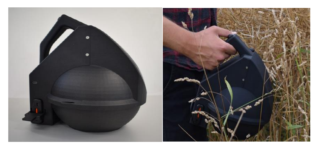
Figure 1. VideometerLite, portable handheld multispectral imaging device.

With its state-of-the-art technology, the instrument allows for the determination of colour, texture, and surface chemical composition of up to 100x100 mm of sample size. Using strobed LED systems, VideometerLite efficiently combines the measurements of seven wavelengths into a single spectral image, where each pixel corresponds to a different reflectance spectrum, wavelength range [405-850 nm] – nonuniformly distributed. Thus it includes both visual and NIR wavelengths for a precise, accurate, and thorough quality inspection foods.