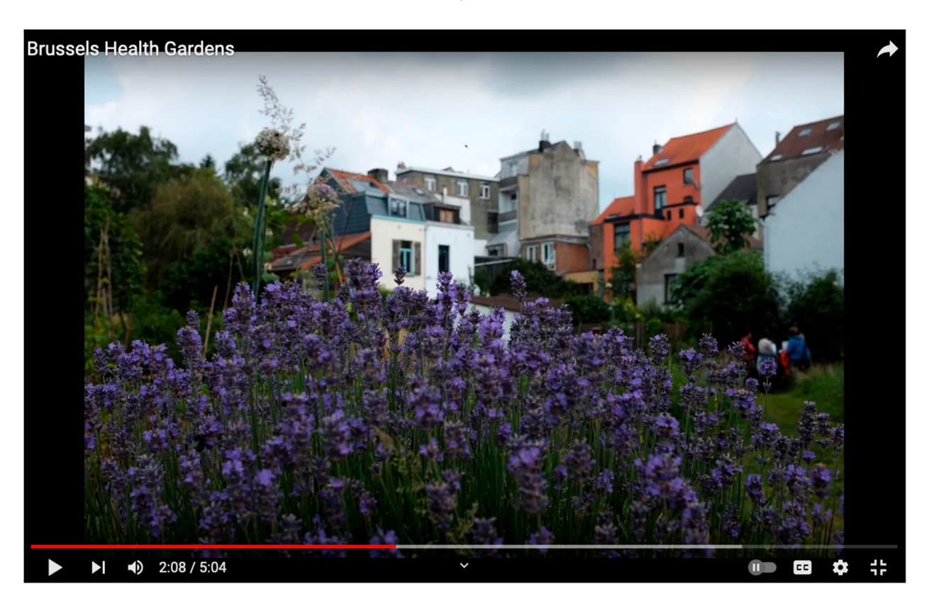
Figure 2. The screenshot of a video which presents an overview of the project in Brussels from 2019–2021. To watch the video: [43].

Figure 2 provides an overview of the project in Brussels from 2019–2021: how the project design evolved from the original university museum project into a more inclusive project that aimed to address the perceived alienation from the natural world (both human and more-than-human world).