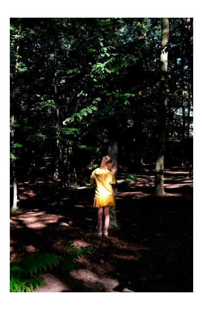
Figure 3. Moments from the BHG co-creation sessions that involved different co-researchers and places in Brussels.