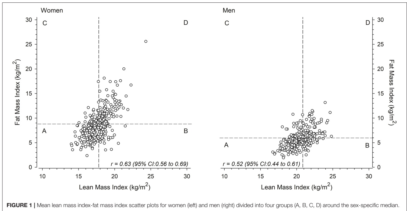
FIGURE 1 | Mean lean mass index-fat mass index scatter plots for women (left) and men (right) divided into four groups (A, B, C, D) around the sex-specific median.