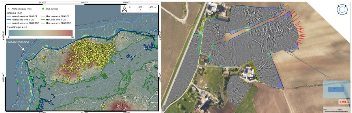
Figure 3: Left: The relationship between the spread of archaeological finds and dated shorelines at Nørholm in Limfjord (Kristiansen et al. 2020) Right: Red lines indicate the relative direction and spacing between observed beach ridges in plan view from Vik in Ørlandet in GPR data (Stamnes, Ystgaard, and Gran 2019)

curve based on dating fossil beach ridges identified in high-resolution digital terrain models and studied settlement patterns on new marine foreland and estimated changes in area and quality for grazing and livestock forage. Archaeological finds and archaeological excavations helped validate relative sea-level curves derived from Optically Stimulated Luminescence (OSL) dated beach ridges. There was a clear correlation in time between all archaeological evidence of human-environment interactions along the prograding coastline, and an improved chronological understanding and higher spatio-temporal accuracy and precision was gained. The Limfjorden estuary in Northern Denmark is a good example of an area that has been subjected to a series of unparalleled changes since the last glacial period (Lewis et al. 2013; Kristiansen et al. 2020).