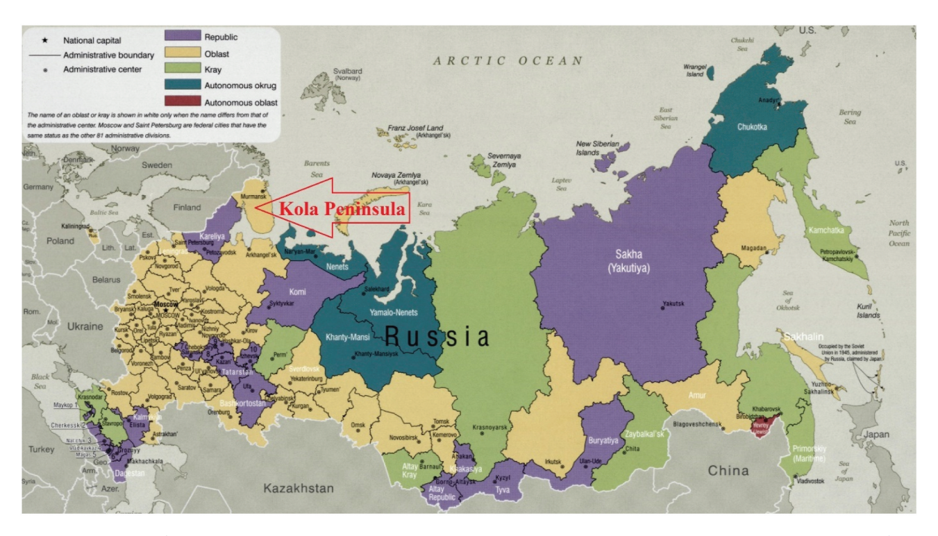
Figure 1. Location of Khibiny apatite-nepheline deposits on the Kola Peninsula, Russia (Available at: https://www.maps-of-the-world.ru/europe/russia/large-scale-administrative-divisions-map-of-russia-2009).

miners may be due to the underestimation of developmental risks and insufficient detection of early pathological signs during annual health screening. Also, a negative impact is caused by the lack of a legislative framework for early (before the official diagnosis is approved) transfer of miners with signs of occupational pathology to jobs unrelated to occupational hazards [10].