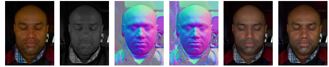
(a) Diff. Alb. (b) Spec. Alb. (c) Diff. Norm. (d) Spec. Norm. (e) Photo (f) Render. (2D)

2.4.2 Diffuse-Specular Separation. For separating the reflectance albedo into diffuse A_D and specular A_S components, we employ a linear system (Eq. 1), similar to that proposed by [Kampouris et al.