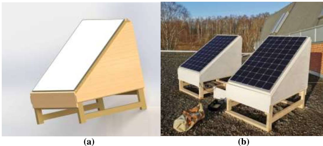
Figure 1. (a) CAD drawing of the test-system. (b) Actual test-systems; S1 at right and S2 at left. (Photo by Jørgen P. Aubell).

The system's inclination angle is determined based on two factors; firstly, since the study's goal is to investigate PV modules' ability to shed snow, it was necessary to create an opportunity for snow to accumulate. Secondly, the recommended all-year tilt for a fixed PV system situated in Norway is 40 degrees [30]. Thus, the test-systems were constructed with a slightly less inclination angle of 35 degrees. The plateau that forms the Norsk Teknisk Museums' roof is covered with gravel, creating some uneven ground. To ensure sufficient horizontal leveling for the test-systems, the inclination angle ended on exactly 34 degrees. The final inclination angle was determined with the assistance of a digital angle instrument. Once the systems were deployed at Norsk Teknisk Museum, the exterior glass surfaces both PV modules were cleaned equally to remove any grease, dust, or other impurities obstructing the modules' glass surface.