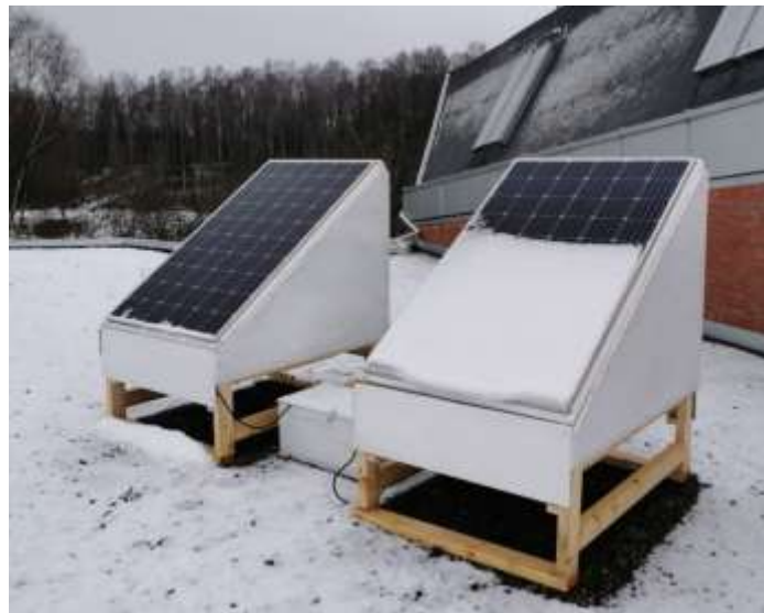
Figure 4. Snow accumulating on the test-systems, 28th of January 2020. Framed PV module situated at the right (S1), and ‘frameless’ PV module situated at the left (S2). (Photo by Jørgen P. Aubell).

differ by less than one percent. One reason for the small difference that slightly benefits S2 can be explained by the inaccuracy of the snow depth sensor used at Blindern weather station. Raw data is sorted based on values of snow depth from Blindern and the author's own weather log. A deviation that has been observed occurred on 28 January 2020, where figure 4 clearly shows that snow is getting stuck on the solar modules and the immediate environment. Weather data from Blindern, however, shows that there was no snow that day [31]. Considering the inaccuracy of the snow depth sensor, the data from the test systems on days without snow can certainly be stated as similar. The calibration of the test systems is ensured by perceiving similar data on days without snow. Any significant differences between the test systems on these days would lead to biased results and affect the validity of the test systems.