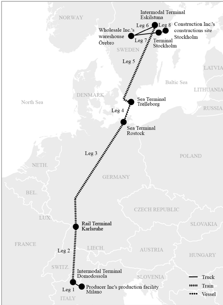
Figure 1. The nodes and transport legs in the supply chain of Geocloth

legs 7 and 8). The order is placed using W's web portal. When W's warehouse in Örebro receives the order and the Geocloth is picked, packed and transferred to the outbound transport area. The Geocloth is then loaded on a truck together with other products directed to the Stockholm area.