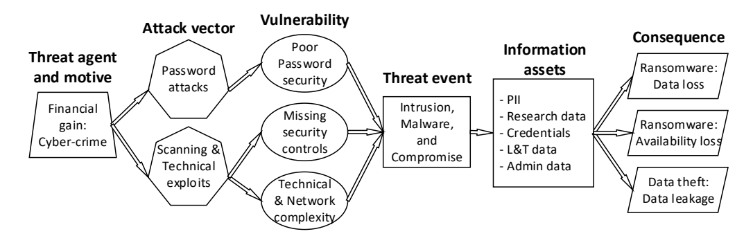
Figure 3. Risk analysis combining threat agents, vulnerabilities, events, assets, and consequences, for the "Intrusions, malware, and compromise"-events.

criminal is to encrypt data with ransomware. The former leads to data leakage and the latter to data and availability loss, as illustrated in Figure 3.