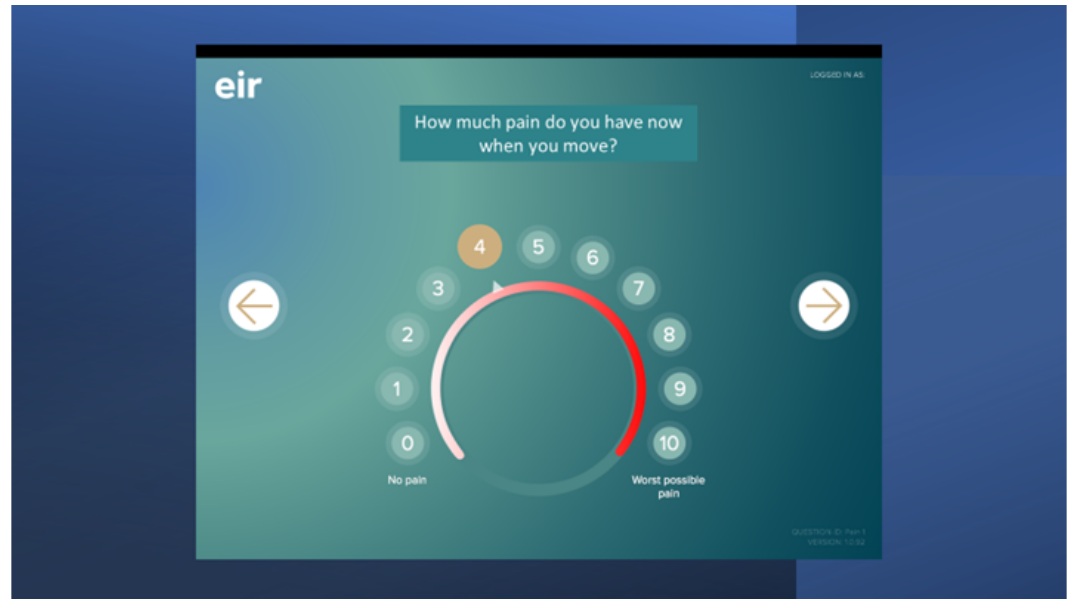
Figure 1. Picture of the application in use with English text (Norwegian text was used in the study).