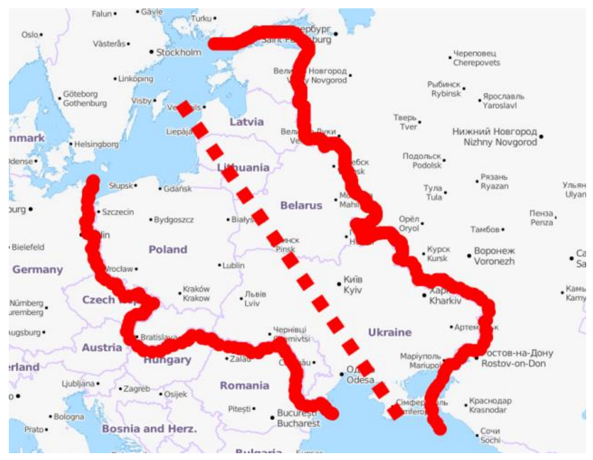
Figure 4: Geographical boundaries of Intermarium overlaid contemporary state borders (geopolityka.net)

Hence, Intermarium can also be described as between three seas rather than just the Baltic and the Black Sea. For the purposes of this thesis, I will define the geographical space of the Intermarium as corresponding to the present day internationally recognized borders of Estonia, Latvia, Lithuania, Poland, Belarus, Ukraine, Moldova, and Transcarpathian Romania. Included in this definition is also the Russian exclave of Kaliningrad.