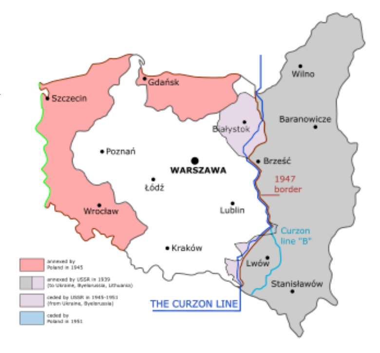
Figure 7: Curzon Line superimposed over Poland's post-WWI and post WWII borders

recommendation, presented by the British foreign secretary Lord Curzon fell far short of the Committee's demands. To the right is an illustration of the Curzon line. Curzon's proposal left most of Ukraine and all of Belarus beyond the Polish border. This included the large Polish cities of Lwów and Wilno. In the West, Curzon conceded Poznan and a narrow corridor to the Baltic Sea, but most of Prussia would remain German. Furthermore, only a small part of southern Silesia was conceded to the Poles. As this line did not reflect the actual military realities at the time, the Curzon line was discarded (Biskupski, 2018).