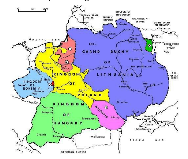
Figure 1: Chodakiewicz's Intermarium (2012)

academic circles, however. In 2015, Polish president Andrzej Duda unveiled the Three Seas Initiative (3SI), a regional project including 12 Eastern EU member states dedicated to improving infrastructure and facilitating economic growth in EU's eastern half (Popławski & Jakóbowski, 2020). The unstated goal of the 3SI is to divest the Eastern EU from Russian energy dependence and increase Polish influence within the Union. The legacy of Intermarium is apparent both in the intentions and naming of this initiative.