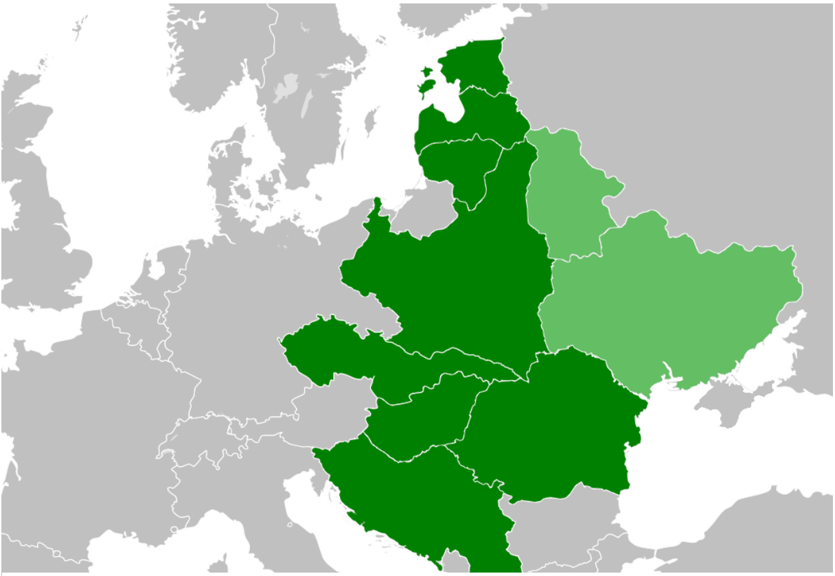
Figure 5: The Intermarium political union as envisioned by Pilsudski, including independent Belarus and Ukraine

This is the time to introduce our dramatis personae. As Poland rose from the ashes of war, two men would emerge as the prominent leaders of modern Poland. The first was Józef Pilsudski. Pilsudski descended from the Polish nobility in old Lithuania and called Wilno (Vilnius) his hometown. A fierce Polish patriot, he cut his teeth as an editor for the Polish Socialist Party's (PPS) newspaper. Pilsudski represented an older strand of Polish nationalism. His background and upbringing emphasized the ideas of the old Commonwealth. This tradition the shared historical, cultural, political and social traditions of the Commonwealth, which had brought together Poles, Lithuanians, Ukrainians, Belarusians and Jews in a necessarily tolerant society. While politically dominated by a Polonized landed nobility, the Commonwealth had been remarkable for its religious tolerance in the age of religious strife in Europe. Pilsudski largely embraced this tradition and hoped to reestablish Poland along the line of the old Commonwealth (Lenkiewicz, 2002). He hoped to incorporate Lithuania, Belarus and Ukraine into a federal state with Poland. Pilsudski's reasoning for essentially reestablishing the Commonwealth was to primarily counterbalance the Russian threat to Polish sovereignty. As such, Pilsudski joined the Central Powers during the Great War. He raised and commanded the Polish Legion to fight alongside the Austrians to liberate Poland. Pilsudski and his men would later be interned in