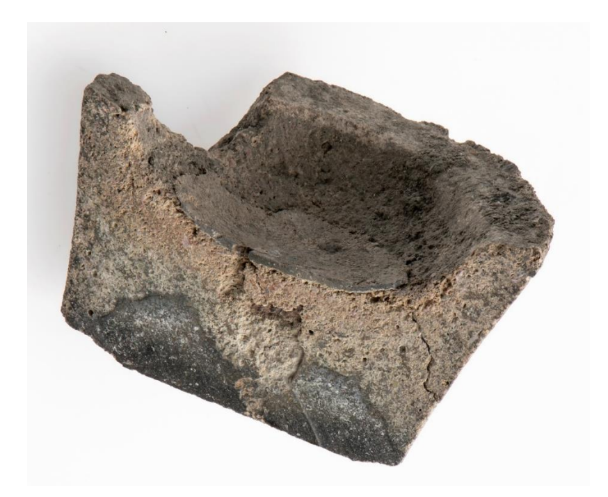
Figure 4. Cross-section of cupel N124860. Upper rim diameter 35 mm, height 23 mm. Note the fine-grained surface layer (i.e. the facing) at the bottom of the bowl and the two dark areas at the bottom of the cupel where lead oxide has filled both cavities between the bone-ash particles and the canals in the bone-ash, in contrast to just in the canals in the bone-ash particles higher up.

of 40 mm and 14 cupels with a rim diameter of 45 mm, which could be placed within a time frame corresponding to their use, cupels either with or without a depression were equally distributed. In total, 61% (22 of 36 cupels), with an almost 50:50 division based on the presence or absence of a depression or not, were found in a levelling layer relating to a fire of 1532, which devastated the eastern and southern parts of Archbishop's Palace, including the second workshop. The fire was caused by the troops of the Protestant king, Frederik I (1523-1533), who attacked the palace in retribution for the archbishop's support to the deposed Catholic king, Christian II (1513-1523).