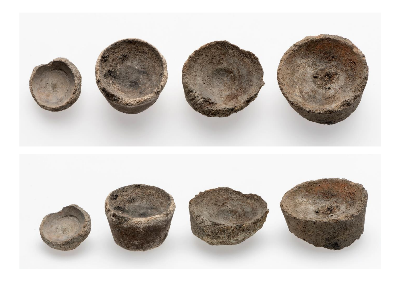
Figure 3. Four bone-ash cupels viewed from two angels. From left to right, they have an outer rim diameter of 30 mm (N125123), 35 mm (N122514), 40 mm (N124858), and 45 mm (N124857), respectively. Note the depression at the bottom of the largest cupels, N124857 and N124858.

A fine-grained surface layer, called facing, has been registered. With the exception of one or two cupels, all cupels have a fine-grained facing layer, which made it easier for all silver to be collected in one bead through cupellation. Erker (1951 (1574) p. 31) underlines the importance to have a good cupel facing. At flaws in the surface layer silver may be lost (Ulseth et al., 2015).