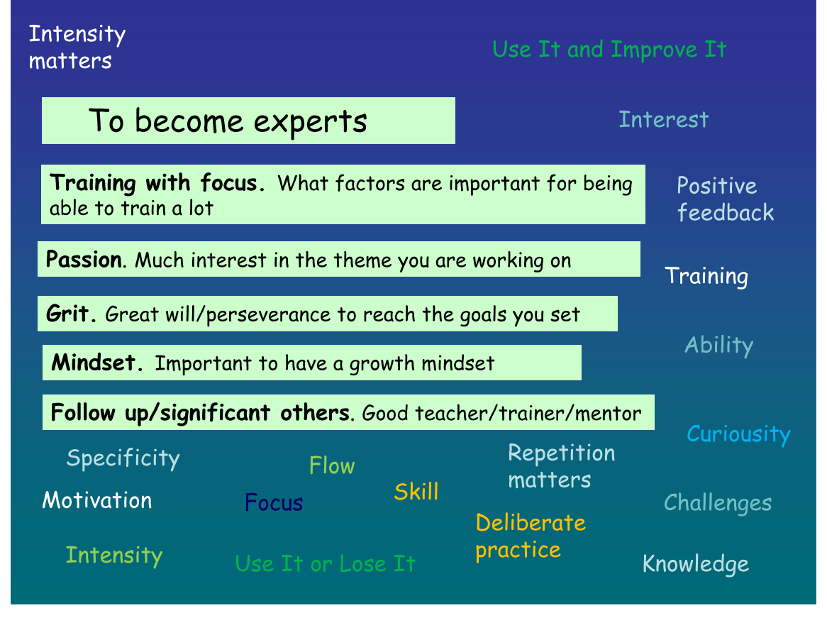
Fig. 1. Different factors of importance for achievement or becoming an experts.

917 participants between 14 and 77 years completed an assessment of passion, grit and mindset. Adolescents from 14 to 19 years (N = 141) were randomly recruited from mainstream secondary schools and high schools. The entire sample reflected the population of adolescents attending schools in these areas and included adolescents from a wide range of socio-economic backgrounds. The adults from 20 to 77 years (N = 776) were randomly selected from a university student population (tested at a university campus in a group setting in normal school hours), sports clubs (football players, female and males on different levels) and