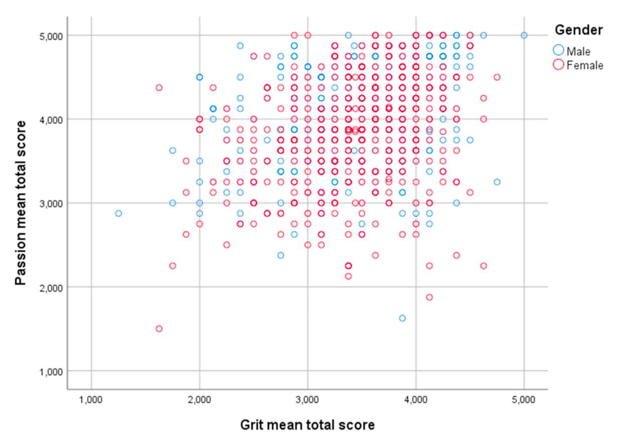
Fig. 2. Correlations between passion and grit for females (r = .311) and males (r = .362).