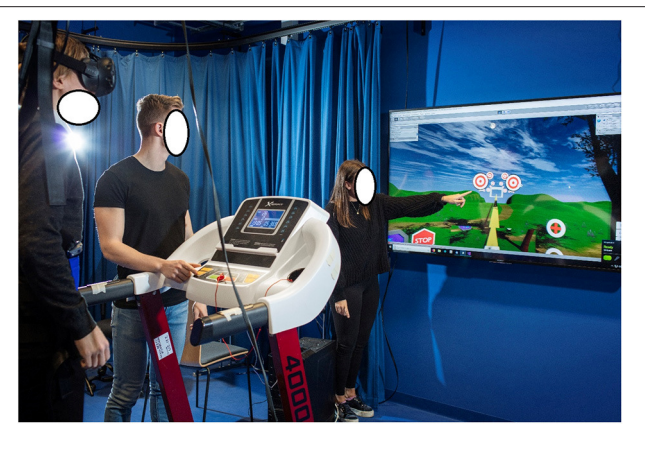
FIGURE 1 | VR-mill game setup. The player is wearing an HMD and a safety harness while walking on the treadmill. Clinicians or assistants can see a 2D image of the scene and the player's actions on the screen in front of the treadmill.

The exergame consisted of six mini-games (Figure 2). The first two mini-games are introduction worlds to familiarize the user with walking on the treadmill while wearing the VR-equipment and setting the user-preferred treadmill speed for