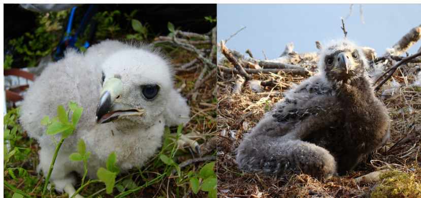
Figure 1. Northern goshawk Accipiter gentilis (left) and white-tailed sea eagle Haliaeetus albicilla (right) nestlings.

(anti-ecto, anti-endo). We investigated the treatment effects on plasma (1) total antioxidant capacity (TAC; an index of nonenzymatic circulating antioxidants), (2) total oxidant status (TOS; a measure of plasma oxidants), and (3) immunoglobulin levels (a measure of humoral immune function). We predicted that treatment against ecto- and endoparasites would reduce the plasma levels of immunoglobulins, as alleviating levels of infectious organisms should ease up the antibody response. As immune responses are costly, both directly in terms of energy and nutrients and indirectly as they may increase oxidative stress (OS), we expected that antiparasite treatments would reduce oxidant levels and increase antioxidant levels. Furthermore, we expected birds treated against both endo- and ectoparasites to have the lowest immunoglobulin and oxidant levels, indicating better health than the other treatment groups.