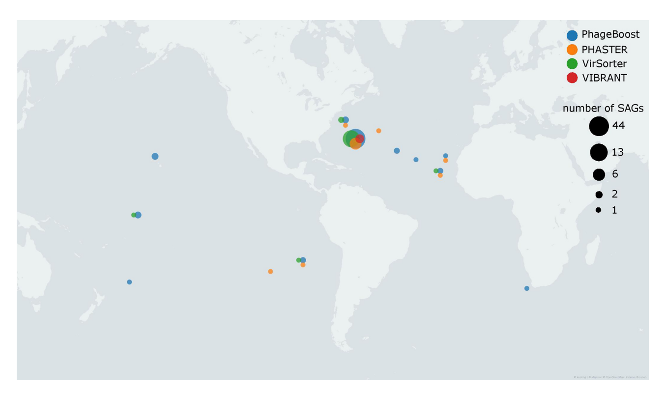
Figure 3. The sampling locations of the SAGs with potential prophage regions found by different prophage predictors and confirmed by virome reads. The coordinates are jittered if multiple prophage predictors overlap. The size of the point is dependent on the number of SAGs found from those coordinates.

gions where most tools often agreed (Supplementary Figure S4). As the homology-based approaches cannot go beyond the current known sequence space, our results show that by utilizing the biological feature space and machine learning, PhageBoost is able to generalize and detect previously unknown viral signals for novel hosts such as Prochlorococcus and SAR11. Furthermore, as the viromes' ecological signal doesn't get saturated with positive predictions, this suggests that a repository of new prophages awaits to be discovered.