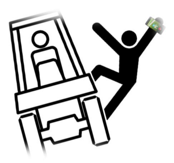
Fig. 8. Negative aspects of playing PG.

leg in Frognerparken in Oslo, so accidents might happen. 2. " Here, the use of the grimacing face emoji is an example of how the text-message genre permeates the iconography of contemporary childhood and subsequently, children's schoolwork. Five more students have used various emojis in their PG texts, and two students have introduced a new paragraph with the graphic elements 3 representing the face of Pikachu, the most popular character in the Pokémon series.