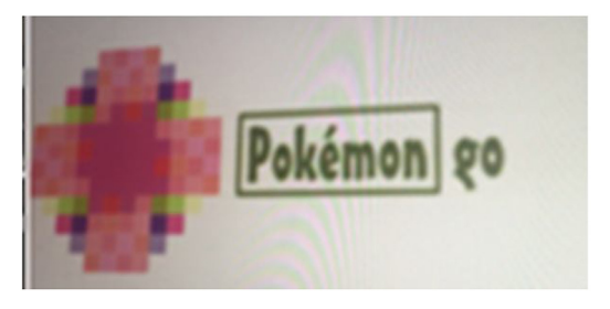
Fig. 1. Jon's Pokémon Go logo in Vistaprint.no.