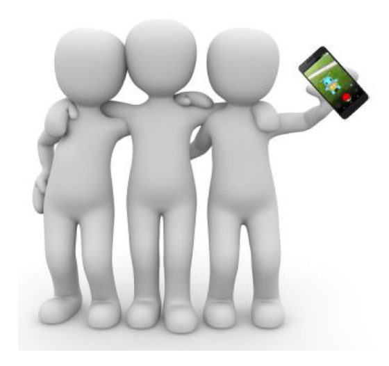
Fig. 7. Positive aspects of playing PG.

chosen "Positive" and "Negative" to signal the two paragraphs that answer the discussion part of the task. According to him, the positive aspects of playing PG revolve around the fact that it is an outdoor social activity: "When gamers are playing Pokémon Go, one spends more time outdoors instead of just staying at home gaming. Being out, one can team up with new friends to hunt for Pokémons." This paragraph taps into the very narrative of Pokémon (i.e., travelling the world to catch creatures), and Jon illustrates this point in a collage combining two images. The three-dimensional illustration of three friends is taken from Can Stock Photo (Fig. 7). Jon has adjusted the original image by rotating it 180 degrees clockwise and has attached a mobile phone displaying the PG game. The phone attracts the viewer's attention due to the contrast in color, establishing salience . This example shows how Jon has used existing material to make a new sign and in this remix process, has transformed or redesigned the semiotic resources to fit the new context.