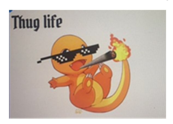
Fig. 6. Thug life Charmander as a screensaver.