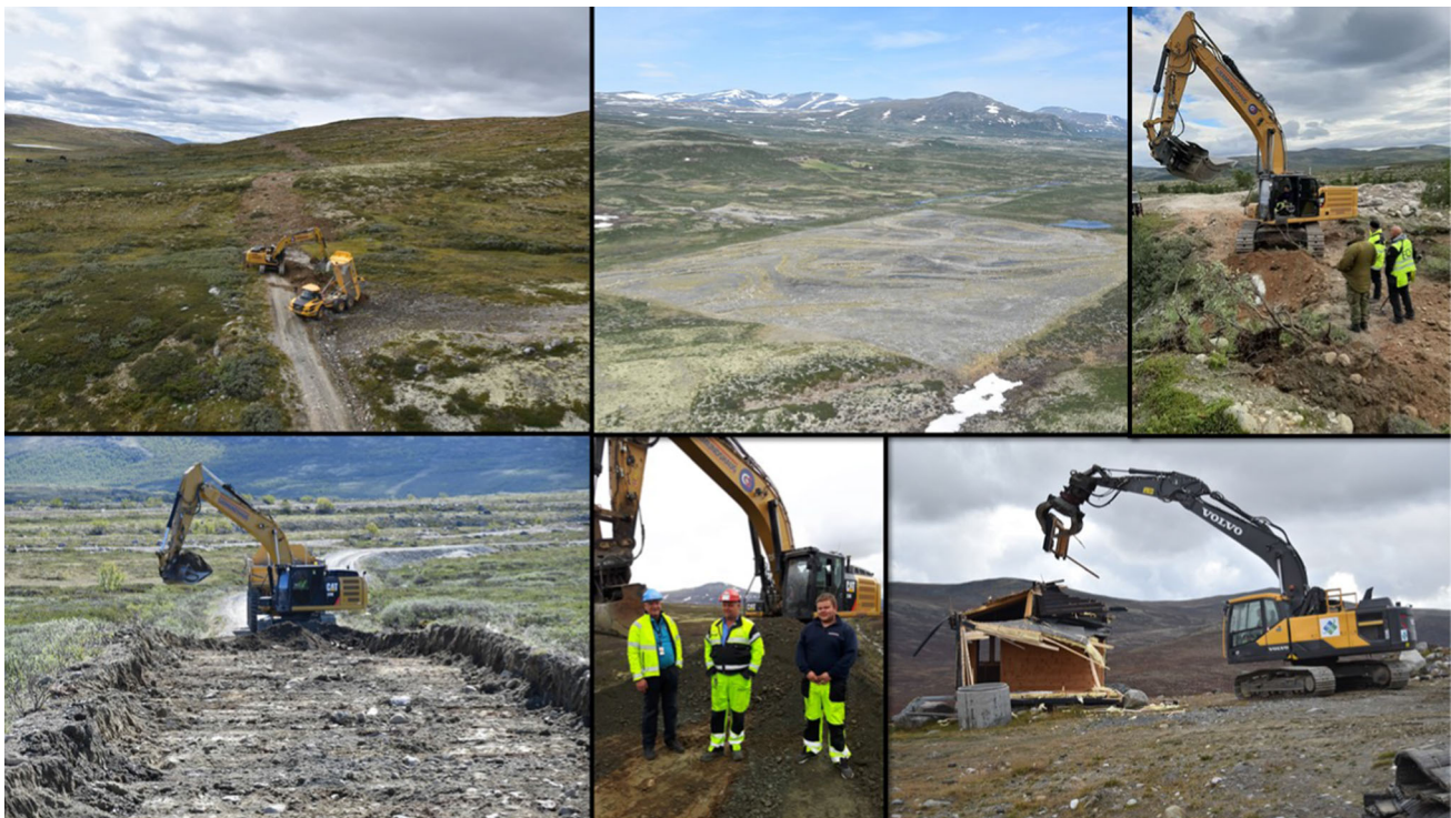
Fig. 2 A core part of the restoration in Hjerkinn military training area is removing of roads and heavy infrastructure. Excavators and dumpers were used to reconstruct natural terrain (upper left) and remove added gravel (bottom left). The project also included restoration of large installations, such as the ammunition test field (upper centre) and pulling down more than 100 buildings (bottom right). Dialog between project owner, machine drivers, explosive experts, and restoration ecologist was crucial during the implementation stage (upper right, bottom centre).