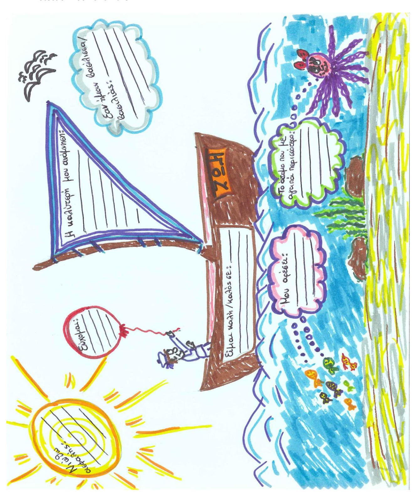
NEXT PAGE: Protection tool for adolescents