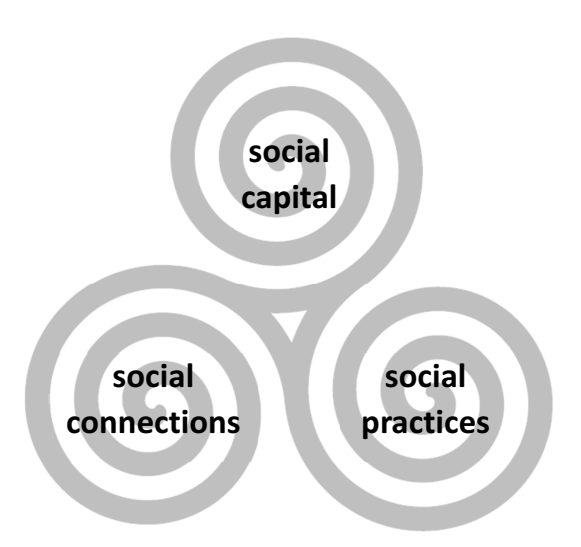
Figure 10.1: The cyclical model of creation of social capital, adapted from Bondeli et al. (2018).

Using the concept of social capital to investigate the development and the role of the social dimension in business relationships is, in this study, a way of approaching the ultimate question of value creation. Although social obligations "cannot act instantaneously, at the appropriate moment, unless they have been established and maintained for a long time, as if for their own sake" (Bourdieu, 1986, p. 54), social capital is, in the long run, a reliable source of future profits, and thus a social resource convertible into economic resources. Thus, although social capital is not directly involved in value creation through providing access to other resources in a business relationship. While the concept of instrumental resources was introduced in IMP research by Prenkert and Hallén (2006), the social dimension of business interaction has not yet been viewed in this light.