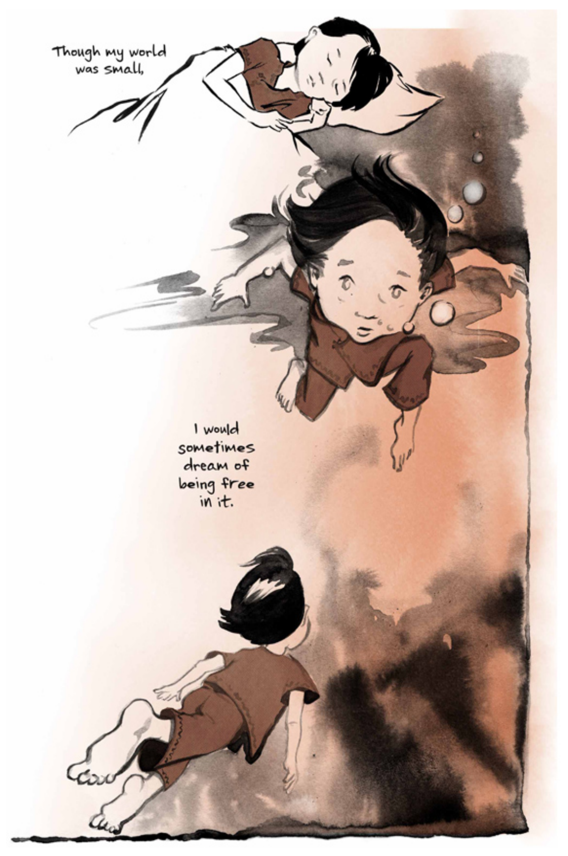
Figure 2 Thi Bui, The Best We Could Do (89).