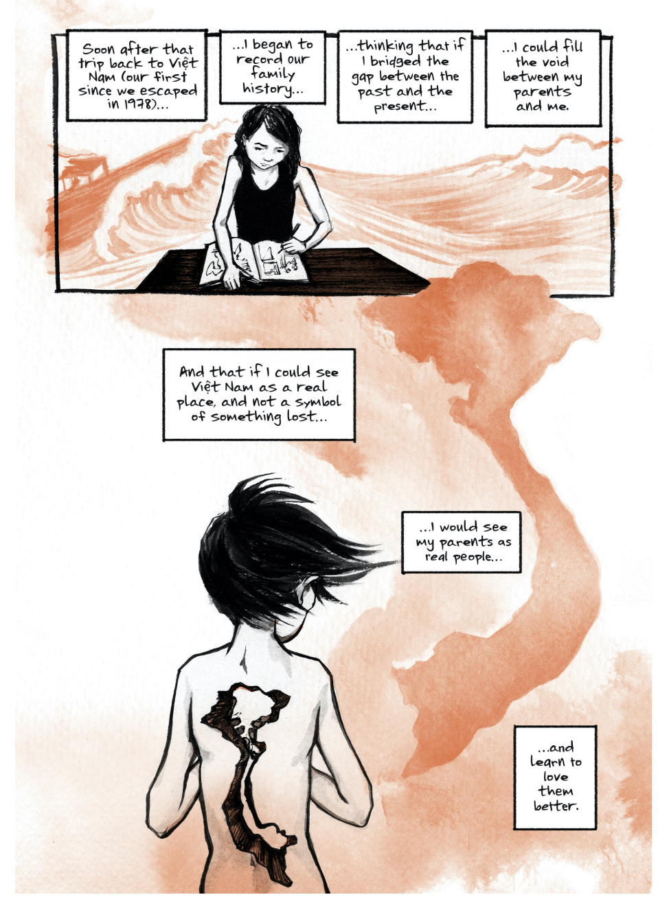
Figure 4 Thi Bui, The Best We Could Do (36).

been made impersonal in the political context of Ut's picture. In contrast, Bui's drawing of the naked child steers away from Ut's full-frontal photography. As such, her act of redrawing enables the wounded female body to turn away from the surveillance of the American gaze all the while spatializing the body within a personal story of survival. The aesthetic practice of spatialization in this case demonstrates that the female body is a site for healing collective national loss.