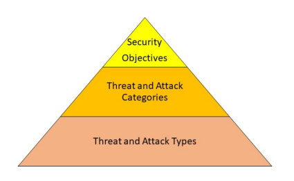
Fig. 2: The Proposed Security Pyramid

In this chapter, we propose the Security Pyramid (Figure 2) as an approach for identifying and analyzing threats and attacks in case studies of IoT enabled Smart Grid. First and foremost, such an identification and analysis require setting the security objectives that stakeholders of an IoT enabled Smart Grid e.g., digital substation prioritize to comply with (Peak of the pyramid). Next, in the middle layer of the pyramid, threats and attacks categories which particularly fall under the set objectives are identified. As the last step, in the bottom layer of the pyramid, actual threats and attacks which are identified for each attack and threat category are defined for the case study in hand.