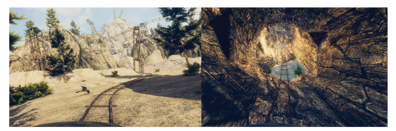
Figure 1. Example of scenes from the roller coaster simulator ("Epic Roller Coaster" by B4T Games).

sensory stimulations to reduce SS during the simulation of a rollercoaster environment, presented using modern consumer-oriented HMD technology. Our investigation implemented a four-armed study conditions similar to D'Amour, Bos, and Keshavarz (2017), using auditory input instead of the airflow; and, similarly to Sawada et al. (2020) employed synchronized vibration and auditory/visual stimuli. The presentation of synchronous sensory stimulation, from a theoretical perspective, may be an important factor for the reduction of SS or for increasing sense of presence in a virtual environment.