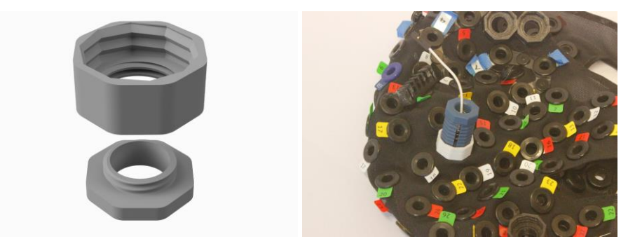
Figure 2. Adapter for EEG-integration. A) Adapter developed to interface the spring-loaded electrodes from OpenBCI with the fNIRS electrode cap. B) Spring loaded electrode mounted on the cap using the adapter.

EEG device in scientific research. The complete setup enables low-cost integration of EEG with fNIRS for multimodal brain imaging, lowering the financial barrier to utilize this cutting-edge research method. An exhaustive description of adapter development can be found in Erichsen et al. (2020), and production files at https://github.com/trolllabs/eeg-technology.