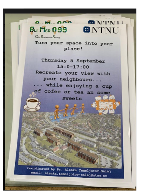
Figure 2. - Residents Playbook – Karolineveiein Figure 3. - Workshop Advertisement Karolineveiein