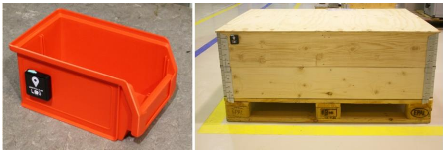
Fig. 2: Examples of SOs

SOs: These are the unit loads that require handling by the MHE (Furmans and Gue 2018). They are uniquely identified through a tag containing a dynamic set of attributes, such as material flow or process of the object, the current and next step of the process, or its physical characteristics (size, weight, fragility, etc.). The tag is localised through one of the IPTs described in the previous section (Fig. 2).