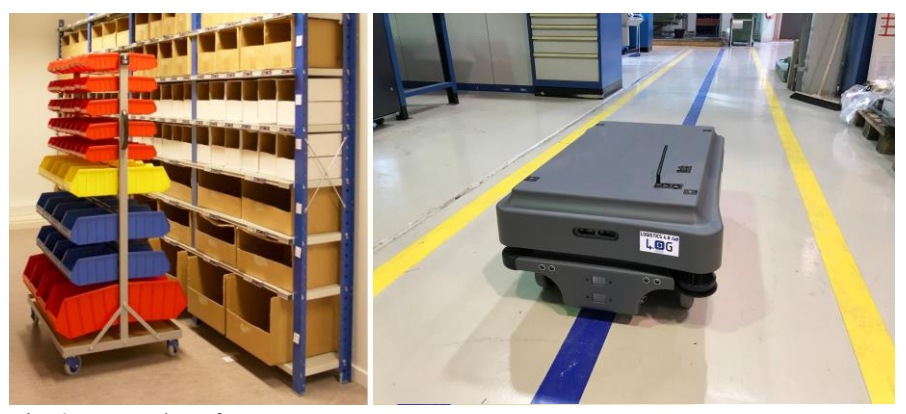
Fig. 3: Examples of MHMs

ICE: This is responsible of the management of the cloud platform where all the information is collected and elaborated (Greis et al. 2019). It receives and stores all the information about the available MHMs and their attributes and functions. These characteristics are matched with the handling requirements sent by the active SOs through a MHMs-SOs compatibility matrix. The ICE is an AI-based computing system, and thanks to several ML algorithms it can predict how the global CMHS performs in different situations. In the ICE, the models, rules, and algorithms for scheduling are implemented. Their performance, such as % of loaded travel time,