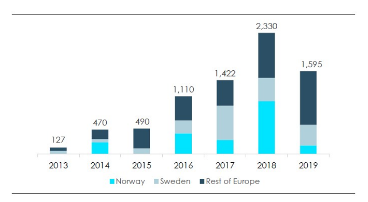
Figure 1: Signed PPAs in Norway and in Europe [MW] (note: the list is not complete). (Copenhagen Economics, 2020)

The seller side of the PPAs mainly consists of traditional power producers and new renewable energy developers of wind and solar power. The offtakers are electricity intensive industry (like aluminium, steel and ferrosilicon) and other consumers with a high electricity consumption (like some retail companies). Data centres have to an increasing degree become buyers of the contracts. (Copenhagen Economics, 2020)